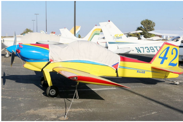
Van's RV-3 Canopy Cover and Engine Plugs