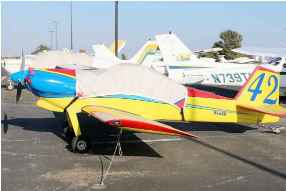
Van's RV-3 Canopy Cover and Engine Plugs

This cover type is made from Silver Acrylic Sunbrella canvas and is 100% lined with a soft and smooth microfiber. Bruce's Custom Covers developed this material combination especially for aircraft protection. The outer material is medium weight and treated for water resistance, UV resistance and anti-static buildup. The inner lining is a very soft and smooth microfiber to prevent scratching. The material is very reflective, and tests show that the cabin interior temperature can be reduced to near-ambient temperature on the hottest of days. It is water, ice and snow repellent, yet breathable to allow moisture to escape from between the cover and the aircraft surface.