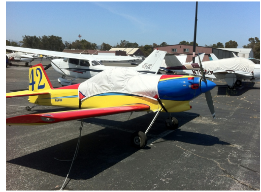
Vans's RV-3 Canopy Cover, Engine Plugs