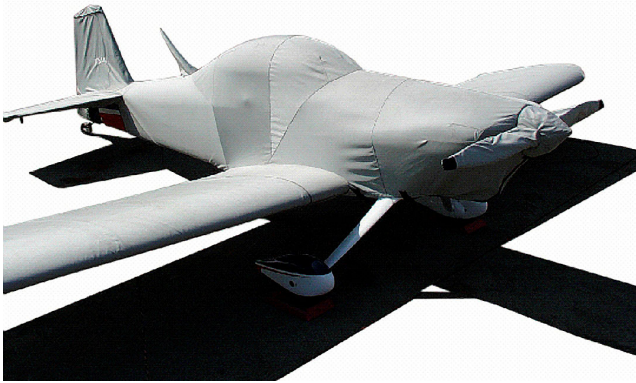
Van's RV-4 Complete Cover

This cover type is made from Silver Acrylic Sunbrella canvas and is 100% lined with a soft and smooth microfiber. Bruce's Custom Covers developed this material combination especially for aircraft protection. The outer material is medium weight and treated for water resistance, UV resistance and anti-static buildup. The inner lining is a very soft and smooth microfiber to prevent scratching. The material is very reflective, and tests show that the cabin interior temperature can be reduced to near-ambient temperature on the hottest of days. It is water, ice and snow repellent, yet breathable to allow moisture to escape from between the cover and the aircraft surface.