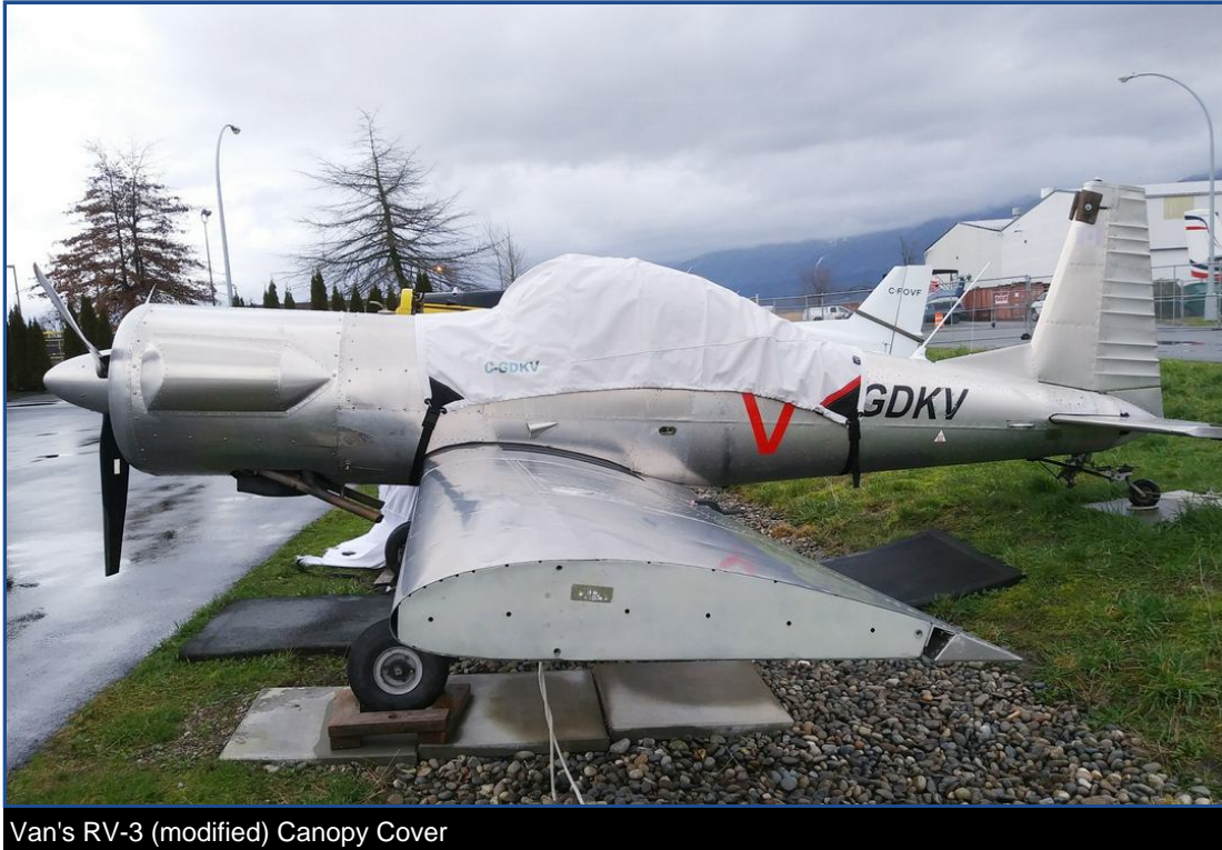
Van's RV-3 (modified) Canopy Cover