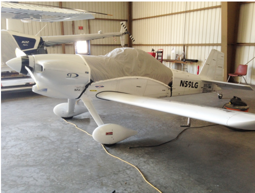
Van's RV-3 Light Weight Travel Cover

Travel Covers are made with Silver Solution-Dyed Polyester fabric and only lined over the windshield to save weight. The material is lightweight and more compact for easy stowage in the aircraft. The polyester material is water resistant, but only intended for occasional use outside. We also have an ultra lightweight material available for fitted hangar dust covers. For daily outdoor use, the non-travel Sunbrella Cover is the best choice.