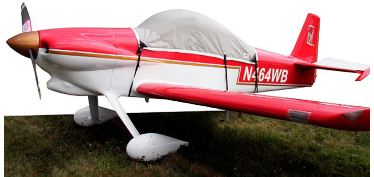
Vans's RV-3 Canopy Cover