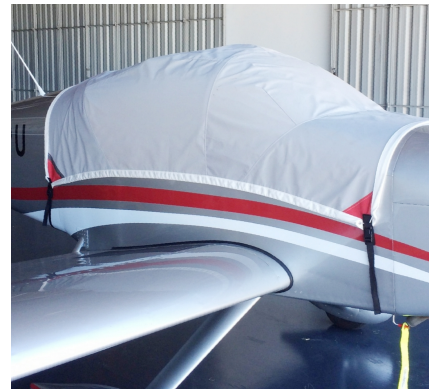
Vans's RV-9 Light Weight Travel Canopy Cover