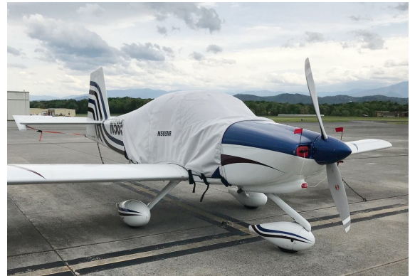
Van's RV-10 Extended Canopy Cover