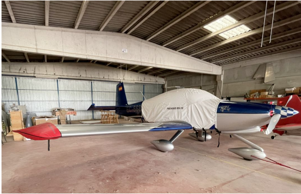
Van's RV-10 Extended Canopy Cover, Wingtip Pads

Designed to prevent damage to the aircraft extremities in crowded hangars, these products are made of bright red Naugahyde and thickly padded with a sandwich of closed cell foam.