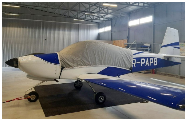
Van's RV-10 Travel Weight Canopy Cover

Travel Covers are made with Silver Solution-Dyed Polyester fabric and only lined over the windshield to save weight. The material is lightweight and more compact for easy stowage in the aircraft. The polyester material is water resistant, but only intended for occasional use outside. We also have an ultra lightweight material available for fitted hangar dust covers. For daily outdoor use, the non-travel Sunbrella Cover is the best choice.