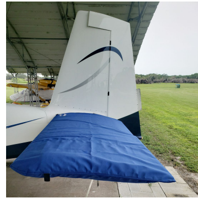
Van's RV-10 Horizontal Stabilizer Covers