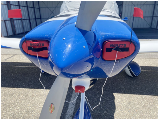
Van's RV-10 Engine Inlet Plugs

Engine Inlet Plugs are custom fit for your Van's Aircraft RV-10 intakes, made with heavy-duty vinyl material, and stuffed with a single block of sculpted urethane foam. Each plug has a zipper that allows the foam to be removed and dried if necessary. Engine plugs have warning flags that are visible from the cockpit or 'remove before flight' streamers sewn onto the face of the plugs. Most plugs are imprinted with the aircraft registration number in black for an extra charge. Storage bag NOT included. Engine plugs may be inserted after flight when the engine is still warm. Engine Inlet Plugs are commonly referred to as Cowl Plugs, Intake Plugs, Cowl Blocks, Engine Blocks, and Engine Bunges.