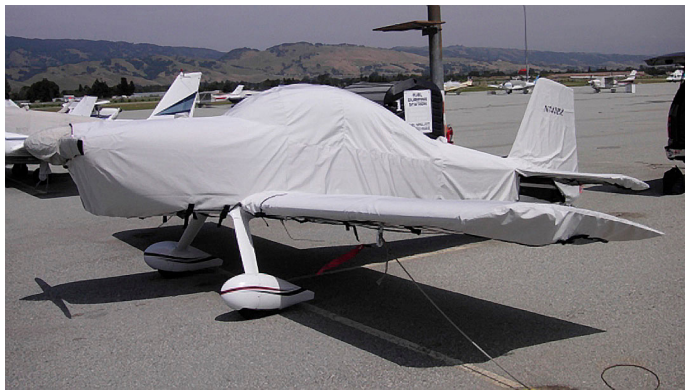
Van's RV-8 Complete Fuselage Cover w/ Detachable Wing Covers & Prop Cover

This cover type is made from Silver Acrylic Sunbrella canvas and is 100% lined with a soft and smooth microfiber. Bruce's Custom Covers developed this material combination especially for aircraft protection. The outer material is medium weight and treated for water resistance, UV resistance and anti-static buildup. The inner lining is a very soft and smooth microfiber to prevent scratching. The material is very reflective, and tests show that the cabin interior temperature can be reduced to near-ambient temperature on the hottest of days. It is water, ice and snow repellent, yet breathable to allow moisture to escape from between the cover and the aircraft surface.