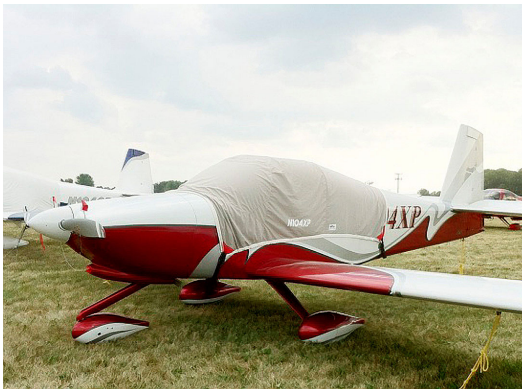
Van's RV-10 Canopy Cover

This cover type is made from Silver Acrylic Sunbrella canvas and is 100% lined with a soft and smooth microfiber. Bruce's Custom Covers developed this material combination especially for aircraft protection. The outer material is medium weight and treated for water resistance, UV resistance and anti-static buildup. The inner lining is a very soft and smooth microfiber to prevent scratching. The material is very reflective, and tests show that the cabin interior temperature can be reduced to near-ambient temperature on the hottest of days. It is water, ice and snow repellent, yet breathable to allow moisture to escape from between the cover and the aircraft surface.