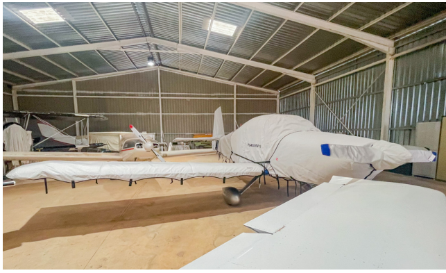
Van's RV-10 Full Cover Set