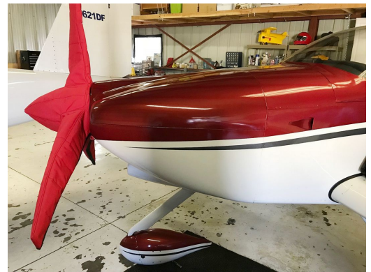
Van's RV-9 Insulated Prop Cover, 3-blade