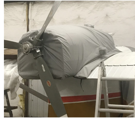
Republic Seabee Amphibian Engine Cover