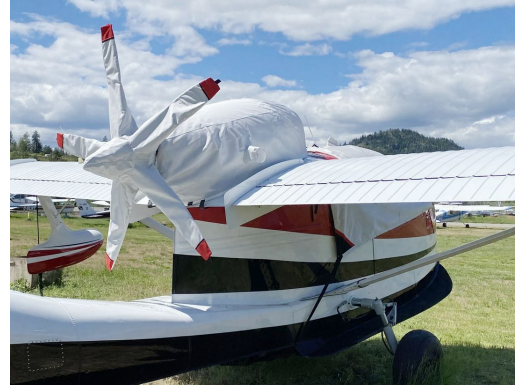
Republic Seabee Canopy, Engine, Prop Cover (5-blade)