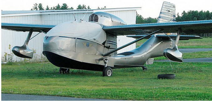
Seabee Canopy Cover

The material is very reflective, and tests show that the cabin interior temperature can be reduced to near-ambient temperature on the hottest of days. It is water, ice and snow repellent, yet breathable to allow moisture to escape from between the cover and the aircraft surface.