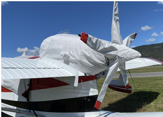
Republic Seabee Canopy, Engine, Prop Cover (5-blade)

water resistance, UV resistance and anti-static buildup. The inner lining is a very soft and smooth microfiber to prevent scratching. The material is very reflective, and tests show that the cabin interior temperature can be reduced to near-ambient temperature on the hottest of days. It is water, ice and snow repellent, yet breathable to allow moisture to escape from between the cover and the aircraft surface.