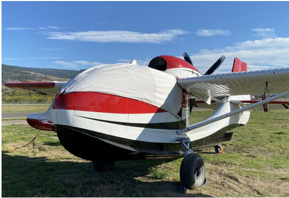
Republic Seabee Canopy Cover