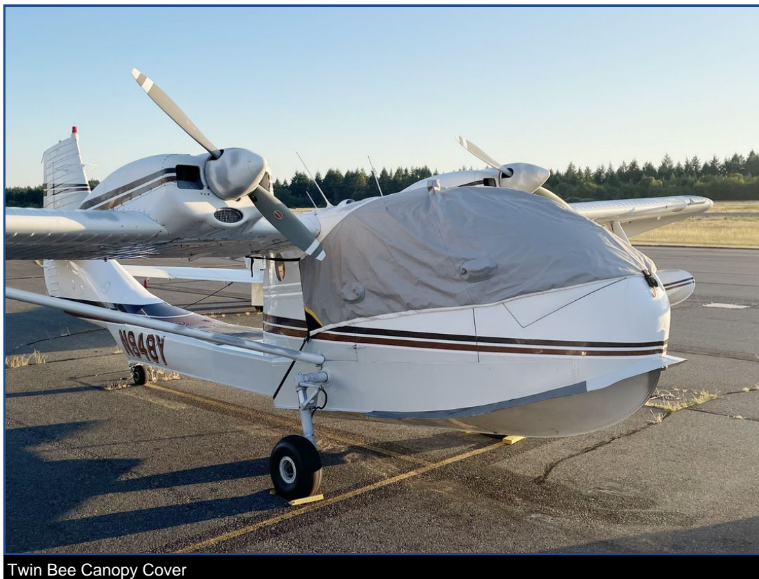
Twin Bee Canopy Cover