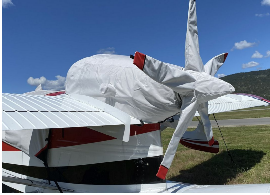
Republic Seabee Canopy, Engine, Prop Cover (5-blade)

The material is very reflective, and tests show that the cabin interior temperature can be reduced to near-ambient temperature on the hottest of days. It is water, ice and snow repellent, yet breathable to allow moisture to escape from between the cover and the aircraft surface.