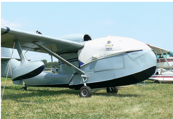
Republic Seabee Canopy Cover

This cover type is made from Silver Acrylic Sunbrella canvas and is 100% lined with a soft and smooth microfiber. Bruce's Custom Covers developed this material combination especially for aircraft protection. The outer material is medium weight and treated for water resistance, UV resistance and anti-static buildup. The inner lining is a very soft and smooth microfiber to prevent scratching. The material is very reflective, and tests show that the cabin interior temperature can be reduced to near-ambient temperature on the hottest of days. It is water, ice and snow repellent, yet breathable to allow moisture to escape from between the cover and the aircraft surface.