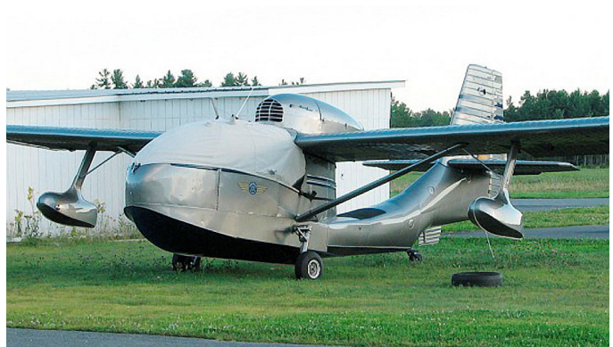
Seabee Canopy Cover