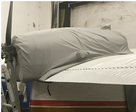
Republic Seabee Amphibian Engine Cover