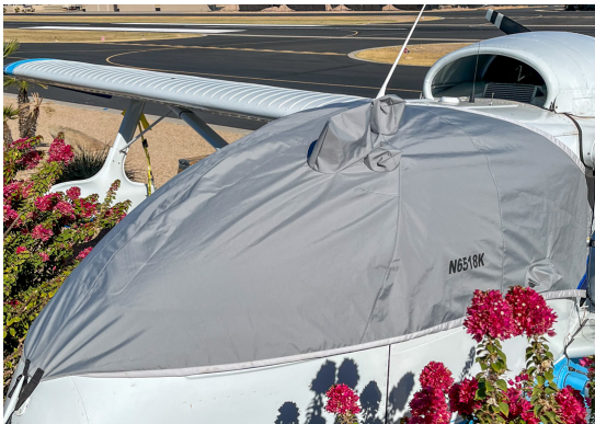
Seabee Amphibian Travel Cover, Light Weight Canopy Cover