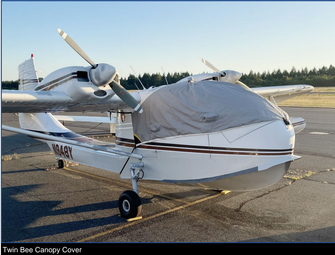
Twin Bee Canopy Cover