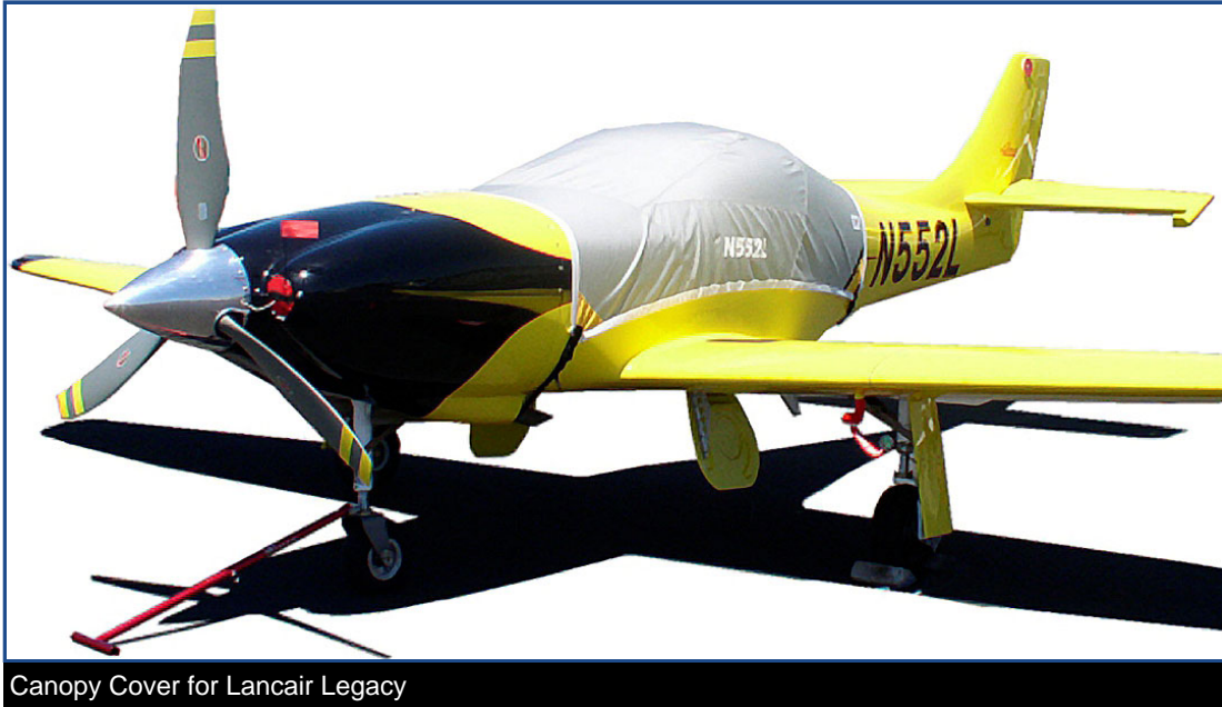
Canopy Cover for Lancair Legacy