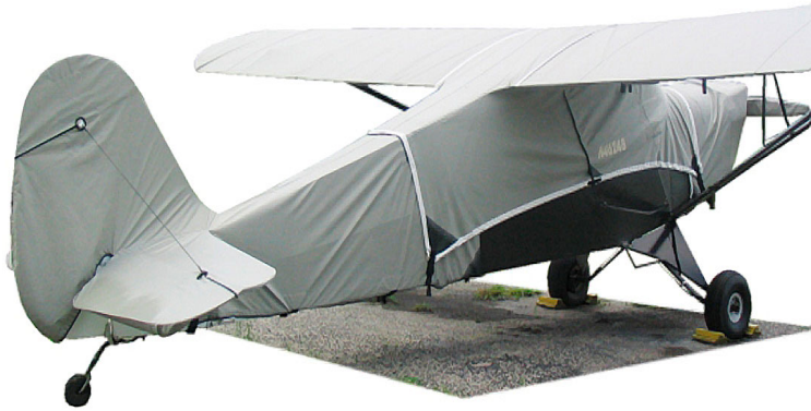
Taylorcraft L-2 Grasshopper Prop, Engine, Canopy, Wing and Empennage Covers