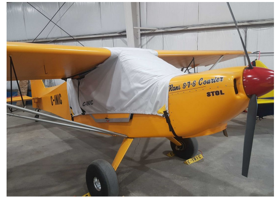
Rans S7 Courier Canopy Cover