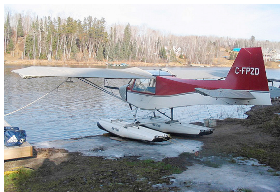
Rans S-7 Insulated Engine Cover, Wing Covers and Horizontal Stabilizer Covers