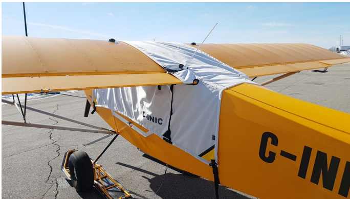
Rans S7-S Canopy Cover Over-The-Top-Style