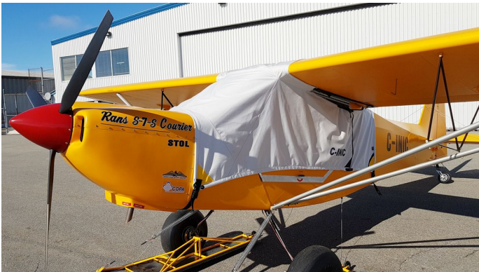
Rans S7-S Canopy Cover Over-The-Top-Style

This cover type is made from Silver Acrylic Sunbrella canvas and is 100% lined with a soft and smooth microfiber. Bruce's Custom Covers developed this material combination especially for aircraft protection. The outer material is medium weight and treated for water resistance, UV resistance and anti-static buildup. The inner lining is a very soft and smooth microfiber to prevent scratching. The material is very reflective, and tests show that the cabin interior temperature can be reduced to near-ambient temperature on the hottest of days. It is water, ice and snow repellent, yet breathable to allow moisture to escape from between the cover and the aircraft surface.