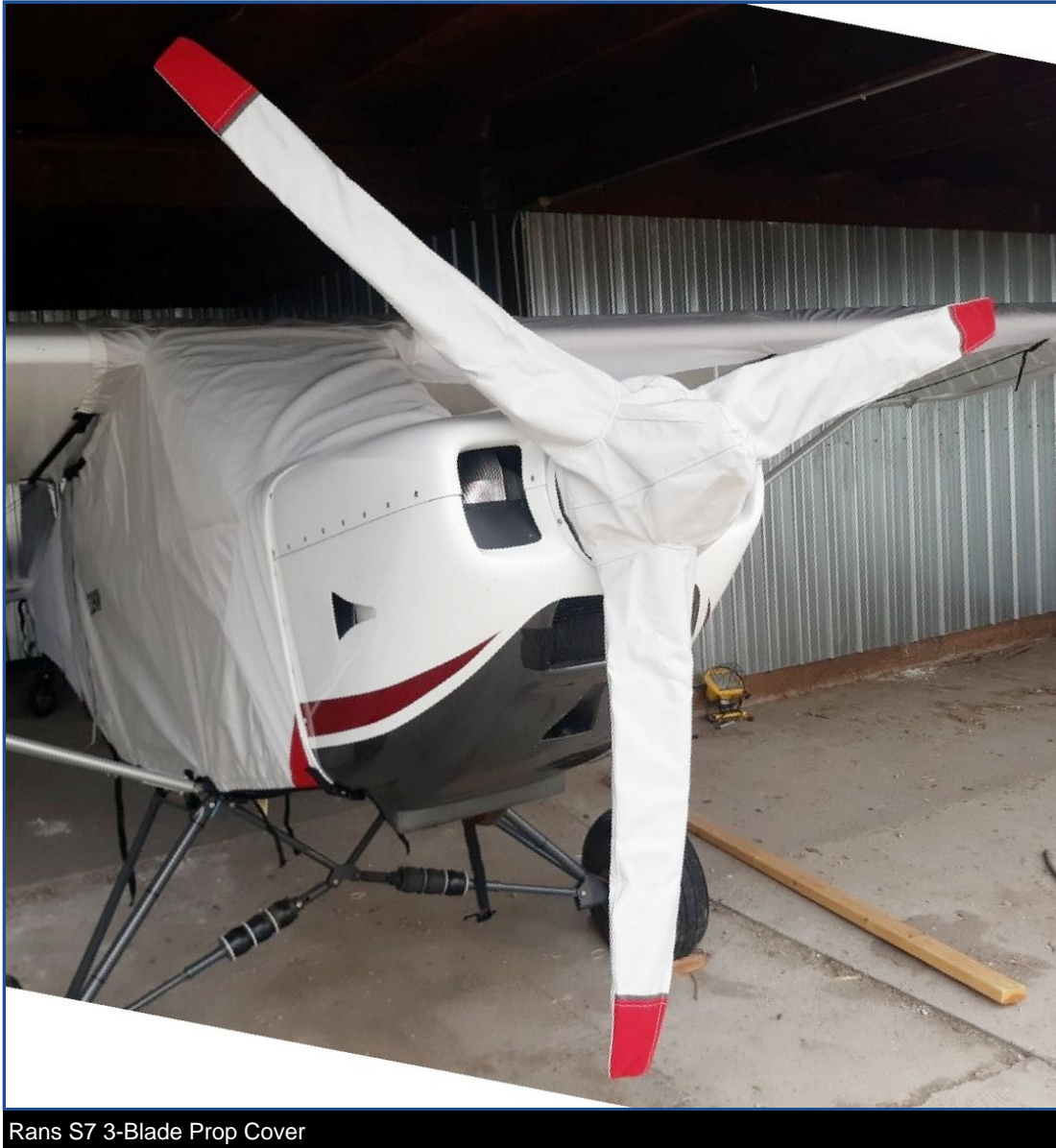
Rans S7 3-Blade Prop Cover