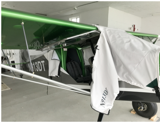
Rans S-7 Courier Canopy Cover (Over-The-Top Style), Belly Strap Type, Lsa Model (S7-S)

This cover type is made from Silver Acrylic Sunbrella canvas and is 100% lined with a soft and smooth microfiber. Bruce's Custom Covers developed this material combination especially for aircraft protection. The outer material is medium weight and treated for water resistance, UV resistance and anti-static buildup. The inner lining is a very soft and smooth microfiber to prevent scratching. The material is very reflective, and tests show that the cabin interior temperature can be reduced to near-ambient temperature on the hottest of days. It is water, ice and snow repellent, yet breathable to allow moisture to escape from between the cover and the aircraft surface.