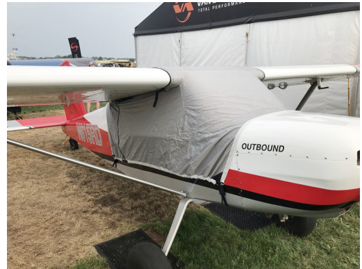
Rans S-21 Travel Canopy Cover