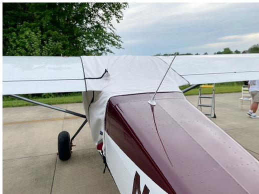
Rans S-21 Outbound Canopy Cover