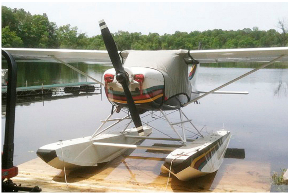
Glastar Sportsman Canopy Cover and Engine Plugs