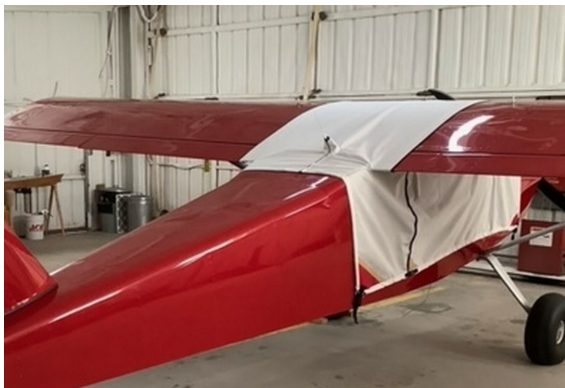
Rans S-21 Over The Top Canopy Cover