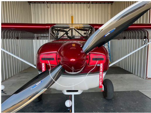
Rans S-21 Engine Plugs

Engine Inlet Plugs are custom fit for your Rans S-21 Outbound intakes, made with heavy-duty vinyl material, and stuffed with a single block of sculpted urethane foam. Each plug has a zipper that allows the foam to be removed and dried if necessary. Engine plugs have warning flags that are visible from the cockpit or 'remove before flight' streamers sewn onto the face of the plugs. Most plugs are imprinted with the aircraft registration number in black for an extra charge. Storage bag NOT included. Engine plugs may be inserted after flight when the engine is still warm. Engine Inlet Plugs are commonly referred to as Cowl Plugs, Intake Plugs, Cowl Blocks, Engine Blocks, and Engine Bungs.