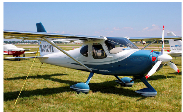
Glastar Sportsman Engine Inlet Plugs