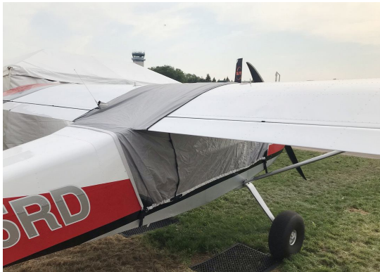
Rans S-21 Travel Canopy Cover

Travel Covers are made with Silver Solution-Dyed Polyester fabric and only lined over the windshield to save weight. The material is lightweight and more compact for easy stowage in the aircraft. The polyester material is water resistant, but only intended for occasional use outside. We also have an ultra lightweight material available for fitted hangar dust covers. For daily outdoor use, the non-travel Sunbrella Cover is the best choice.