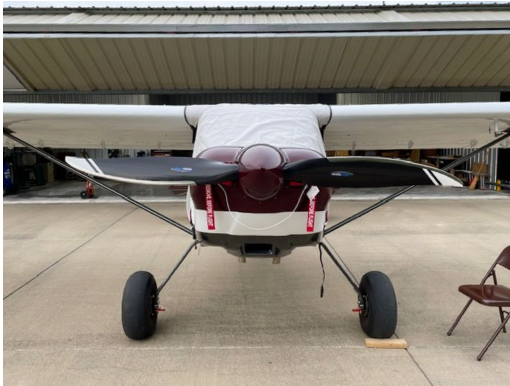
Rans S-21 Outbound Canopy Cover