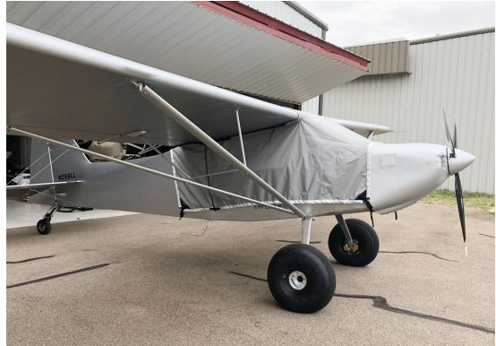
RANS S20 TRAVEL COVER