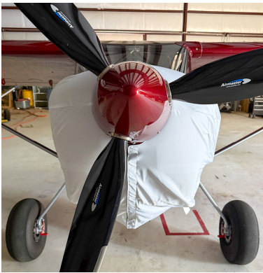
Rans S-21 Engine Cover, test fit cover