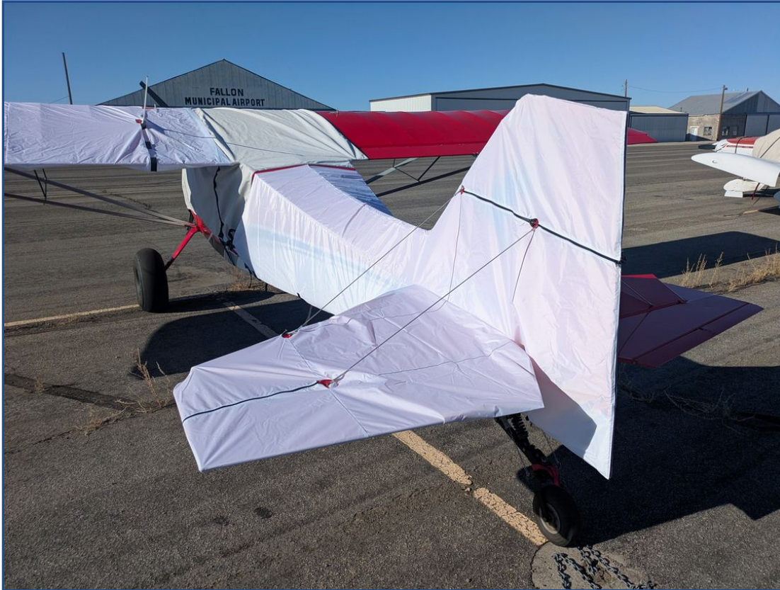
Rans S-20 Raven Canopy Cover, Wing Covers & Empennage Cover (some test fit)