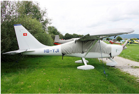
Glastar Canopy, Wings, Horizontal Stab. & Prop Covers

WINTER USE MATERIAL - Made with Solution-Dyed Polyester fabric, this option is intended for seasonal use to aid in deicing, rain mitigation, or for occasional travel. The material is lighter and more compact, but more susceptible to UV damage and may have a shorter useful life if used continuously outside than the all-year use material.