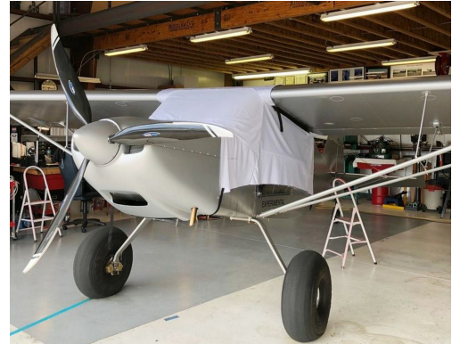
Rans S-20 Canopy Cover, test fit cover