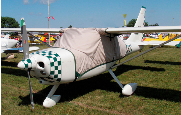
Glastar Over-Top Canopy Cover

This cover type is made from Silver Acrylic Sunbrella canvas and is 100% lined with a soft and smooth microfiber. Bruce's Custom Covers developed this material combination especially for aircraft protection. The outer material is medium weight and treated for water resistance, UV resistance and anti-static buildup. The inner lining is a very soft and smooth microfiber to prevent scratching. The material is very reflective, and tests show that the cabin interior temperature can be reduced to near-ambient temperature on the hottest of days. It is water, ice and snow repellent, yet breathable to allow moisture to escape from between the cover and the aircraft surface.