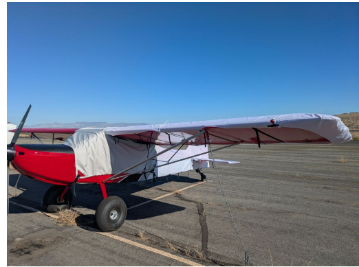
Rans S-20 Raven Canopy Cover, Wing Covers & Empennage Cover (some test fit)