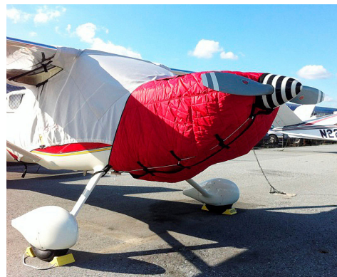
Glstar Insulated Engine Cover