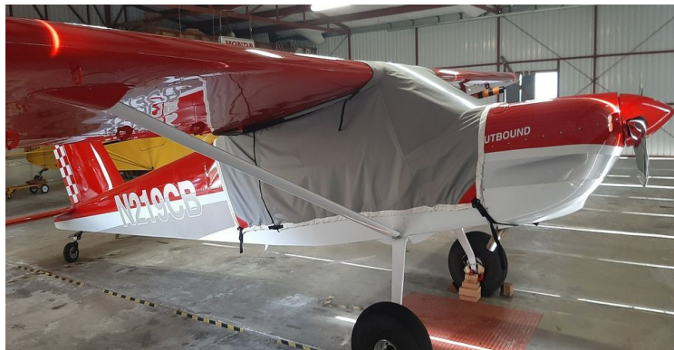
RANS S-21 Travel Weight Canopy Cover

Travel Covers are made with Silver Solution-Dyed Polyester fabric and only lined over the windshield to save weight. The material is lightweight and more compact for easy stowage in the aircraft. The polyester material is water resistant, but only intended for occasional use outside. We also have an ultra lightweight material available for fitted hangar dust covers. For daily outdoor use, the non-travel Sunbrella Cover is the best choice.