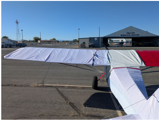
Rans S-20 Raven Canopy Cover, Wing Covers & Empennage Cover (some test fit)

WINTER USE MATERIAL - Made with Solution-Dyed Polyester fabric, this option is intended for seasonal use to aid in deicing, rain mitigation, or for occasional travel. The material is lighter and more compact, but more susceptible to UV damage and may have a shorter useful life if used continuously outside than the all-year use material.