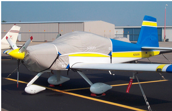
Van's RV-9 Canopy & Engine Covers

This cover type is made from Silver Acrylic Sunbrella canvas and is 100% lined with a soft and smooth microfiber. Bruce's Custom Covers developed this material combination especially for aircraft protection. The outer material is medium weight and treated for water resistance, UV resistance and anti-static buildup. The inner lining is a very soft and smooth microfiber to prevent scratching. The material is very reflective, and tests show that the cabin interior temperature can be reduced to near-ambient temperature on the hottest of days. It is water, ice and snow repellent, yet breathable to allow moisture to escape from between the cover and the aircraft surface.