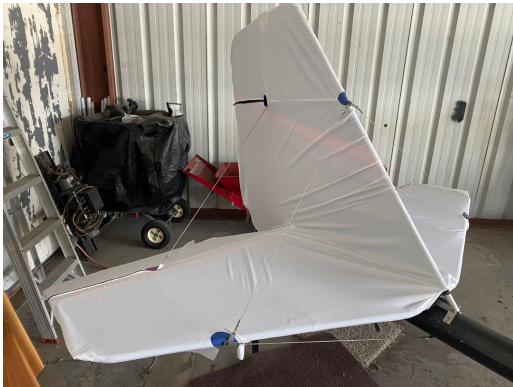
Rans S-12 Empennage Cover, test fit

WINTER USE MATERIAL - Made with Solution-Dyed Polyester fabric, this option is intended for seasonal use to aid in deicing, rain mitigation, or for occasional travel. The material is lighter and more compact, but more susceptible to UV damage and may have a shorter useful life if used continuously outside than the all-year use material.