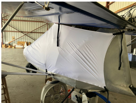
Rans S-12 Canopy/Nose Cover, test fit