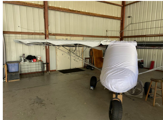
Rans S-12 Canopy/Nose & Wing Covers, test fit