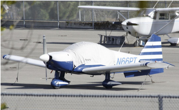
Robin R-2160 Canopy Cover with 12" forward Extension