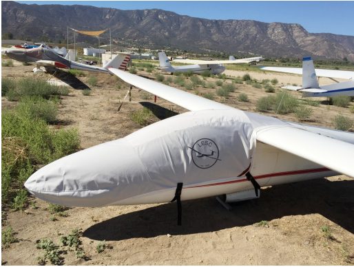
Pilatus B4 Canopy/Nose Cover