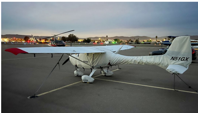
Remos RG-3 Complete Cover Set

This cover type is made from Silver Acrylic Sunbrella canvas and is 100% lined with a soft and smooth microfiber. Bruce's Custom Covers developed this material combination especially for aircraft protection. The outer material is medium weight and treated for water resistance, UV resistance and anti-static buildup. The inner lining is a very soft and smooth microfiber to prevent scratching. The material is very reflective, and tests show that the cabin interior temperature can be reduced to near-ambient temperature on the hottest of days. It is water, ice and snow repellent, yet breathable to allow moisture to escape from between the cover and the aircraft surface.