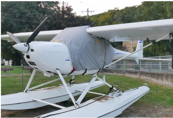
Remos G3 Extended Canopy Cover (Over-Top-Type Style)

This cover type is made from Silver Acrylic Sunbrella canvas and is 100% lined with a soft and smooth microfiber. Bruce's Custom Covers developed this material combination especially for aircraft protection. The outer material is medium weight and treated for water resistance, UV resistance and anti-static buildup. The inner lining is a very soft and smooth microfiber to prevent scratching. The material is very reflective, and tests show that the cabin interior temperature can be reduced to near-ambient temperature on the hottest of days. It is water, ice and snow repellent, yet breathable to allow moisture to escape from between the cover and the aircraft surface.