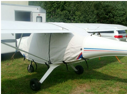
Remos G3 & GX MODELS Extended Canopy Cover (Over-The-Top Style)

This cover type is made from Silver Acrylic Sunbrella canvas and is 100% lined with a soft and smooth microfiber. Bruce's Custom Covers developed this material combination especially for aircraft protection. The outer material is medium weight and treated for water resistance, UV resistance and anti-static buildup. The inner lining is a very soft and smooth microfiber to prevent scratching. The material is very reflective, and tests show that the cabin interior temperature can be reduced to near-ambient temperature on the hottest of days. It is water, ice and snow repellent, yet breathable to allow moisture to escape from between the cover and the aircraft surface.