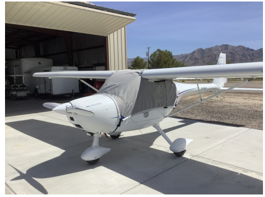
Remos G-3/600 Travel Cover