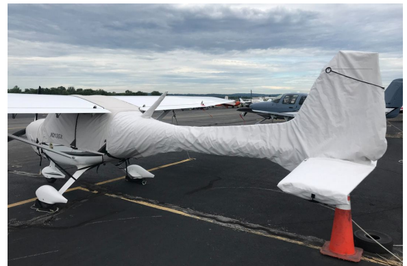
Remos G3 & GX MODELS Empennage Cover