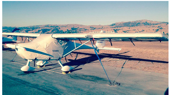
Remos Extended Canopy/Engine, Wing Covers