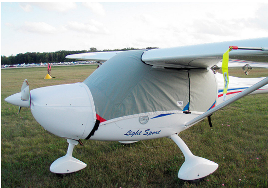
Remos G3 Travel Weight Canopy Cover