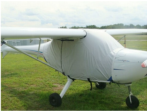
Remos G3 & GX MODELS Extended Canopy Cover (Over-The-Top Style)