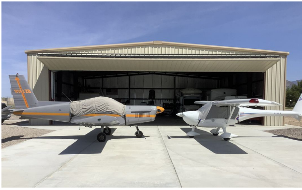
G-3/600 Travel Cover and Zlin 142 Canopy Cover