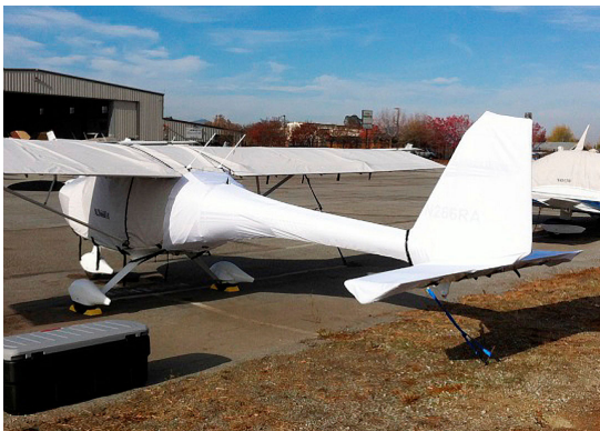
Remos Empennage Cover (test fit cover)

WINTER USE MATERIAL - Made with Solution-Dyed Polyester fabric, this option is intended for seasonal use to aid in deicing, rain mitigation, or for occasional travel. The material is lighter and more compact, but more susceptible to UV damage and may have a shorter useful life if used continuously outside than the all-year use material.