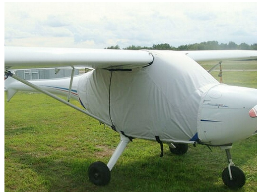
Remos G3 & GX MODELS Extended Canopy Cover (Over-The-Top Style)