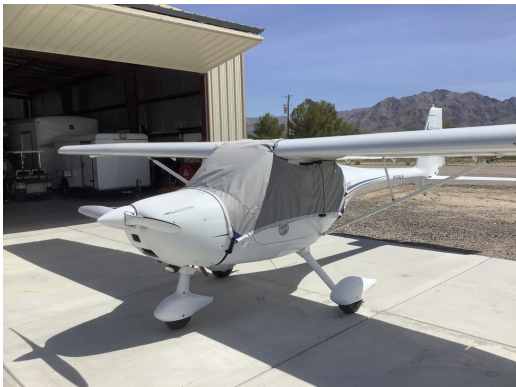
Remos G-3/600 Travel Cover

Travel Covers are made with Silver Solution-Dyed Polyester fabric and only lined over the windshield to save weight. The material is lightweight and more compact for easy stowage in the aircraft. The polyester material is water resistant, but only intended for occasional use outside. We also have an ultra lightweight material available for fitted hangar dust covers. For daily outdoor use, the non-travel Sunbrella Cover is the best choice.