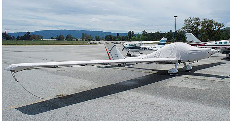
Grob 109 Canopy/Engine w/ extension to tail, Wing, Stabilizer & Prop/Spinner Covers