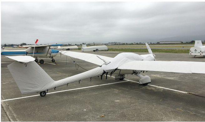
Distar Sundancer LSA Extended Canopy/Engine, Prop, Wheelpants, Wings & Empennage Covers

WINTER USE MATERIAL - Made with Solution-Dyed Polyester fabric, this option is intended for seasonal use to aid in deicing, rain mitigation, or for occasional travel. The material is lighter and more compact, but more susceptible to UV damage and may have a shorter useful life if used continuously outside than the all-year use material.