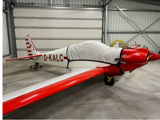
Fournier RF-4D Motor glider Canopy Cover