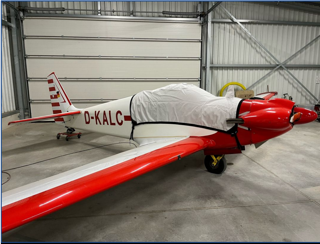
Fournier RF-4D Motorglider Canopy Cover