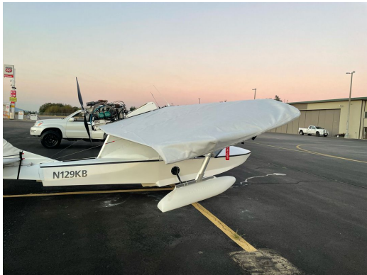
SeaRey Wing Covers

WINTER USE MATERIAL - Made with Solution-Dyed Polyester fabric, this option is intended for seasonal use to aid in deicing, rain mitigation, or for occasional travel. The material is lighter and more compact, but more susceptible to UV damage and may have a shorter useful life if used continuously outside than the all-year use material.