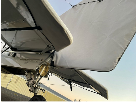
SeaRey Empennage Covers

WINTER USE MATERIAL - Made with Solution-Dyed Polyester fabric, this option is intended for seasonal use to aid in deicing, rain mitigation, or for occasional travel. The material is lighter and more compact, but more susceptible to UV damage and may have a shorter useful life if used continuously outside than the all-year use material.