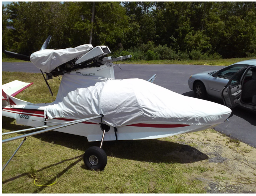
SeaRey Canopy/Nose Cover