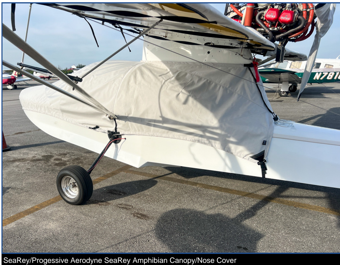
SeaRey/Progressive Aerodyne SeaRey Amphibian Canopy/Nose Cover