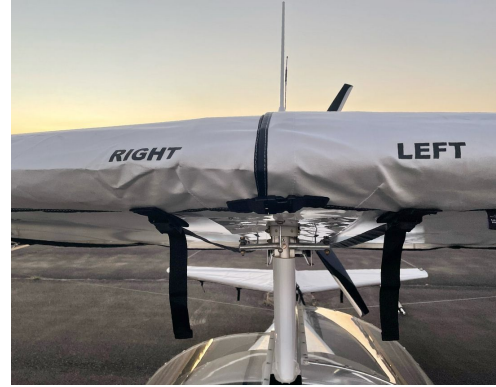
SeaRey Wing Covers