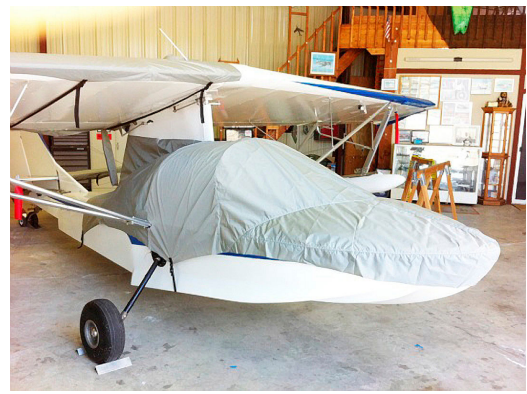
SeaRey Canopy Cover (test fit cover)