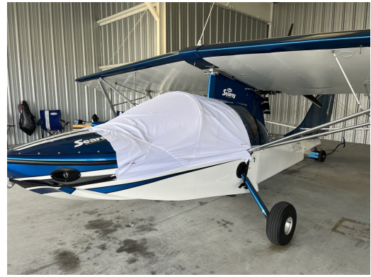
SeaRey Cockpit ONLY Cover, test fit cover