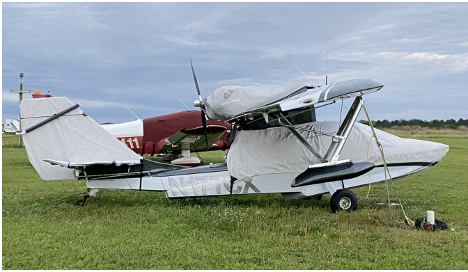
Searey Canopy/Nose, Engine & Empennage Cover