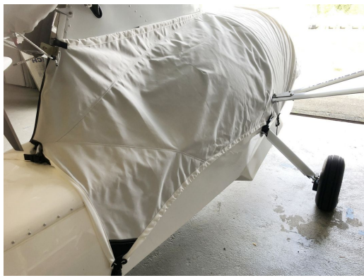
Searey Canopy/Nose Cover