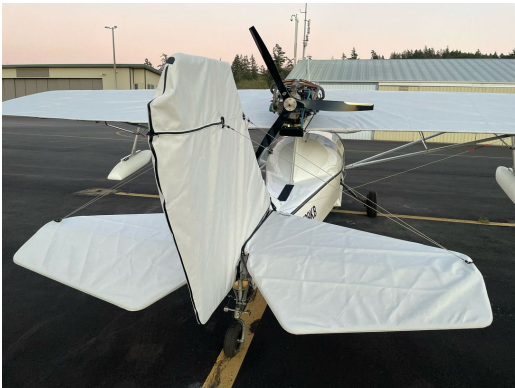
SeaRey Empennage & Wing Covers