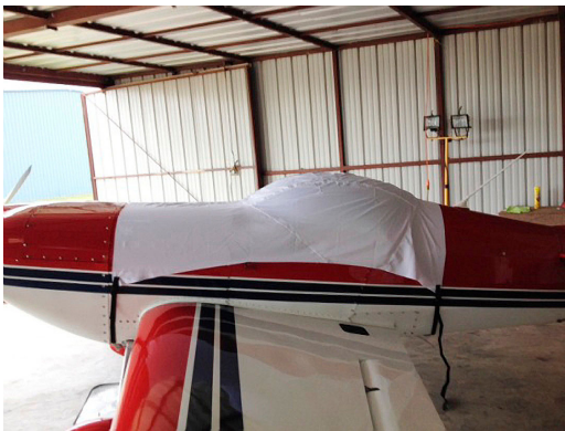
IAC One Design Canopy Cover, test fit cover

This cover type is made from Silver Acrylic Sunbrella canvas and is 100% lined with a soft and smooth microfiber. Bruce's Custom Covers developed this material combination especially for aircraft protection. The outer material is medium weight and treated for water resistance, UV resistance and anti-static buildup. The inner lining is a very soft and smooth microfiber to prevent scratching. The material is very reflective, and tests show that the cabin interior temperature can be reduced to near-ambient temperature on the hottest of days. It is water, ice and snow repellent, yet breathable to allow moisture to escape from between the cover and the aircraft surface.