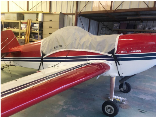
IAC One Design Travel Weight Canopy Cover

Travel Covers are made with Silver Solution-Dyed Polyester fabric and only lined over the windshield to save weight. The material is lightweight and more compact for easy stowage in the aircraft. The polyester material is water resistant, but only intended for occasional use outside. We also have an ultra lightweight material available for fitted hangar dust covers. For daily outdoor use, the non-travel Sunbrella Cover is the best choice.