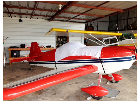
IAC One Design Canopy Cover, test fit cover