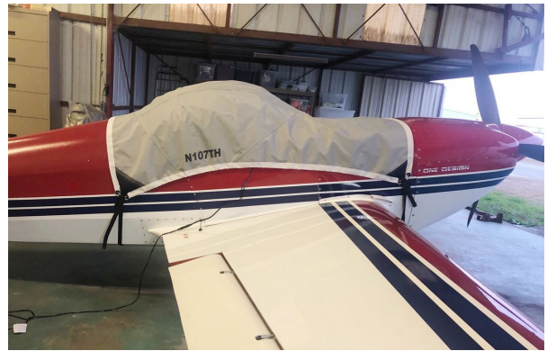
IAC One Design Travel Weight Canopy Cover