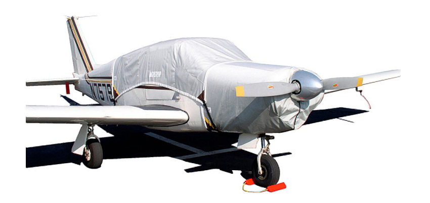
Piper Comanche Canopy & Engine Covers