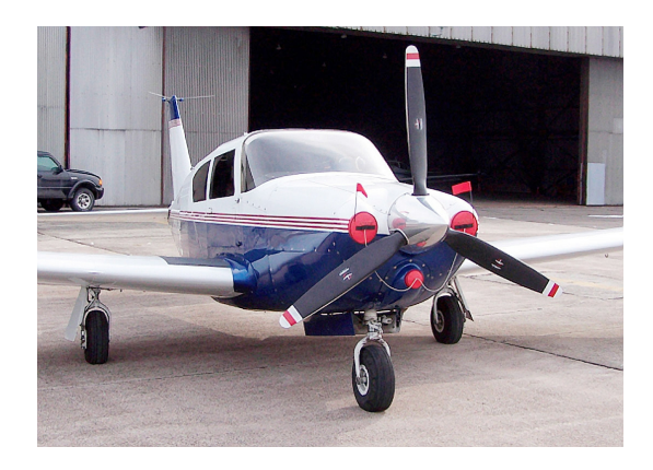
Piper Comanche Engine Plugs

Engine Inlet Plugs are custom fit for your Ravin 300 & 500 Models intakes, made with heavy-duty vinyl material, and stuffed with a single block of sculpted urethane foam. Each plug has a zipper that allows the foam to be removed and dried if necessary. Engine plugs have warning flags that are visible from the cockpit or 'remove before flight' streamers sewn onto the face of the plugs. Most plugs are imprinted with the aircraft registration number in black for an extra charge. Storage bag NOT included. Engine plugs may be inserted after flight when the engine is still warm. Engine Inlet Plugs are commonly referred to as Cowl Plugs, Intake Plugs, Cowl Blocks, Engine Blocks, and Engine Bungs.