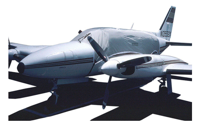
Covers & Plugs for the Aero Commander 700