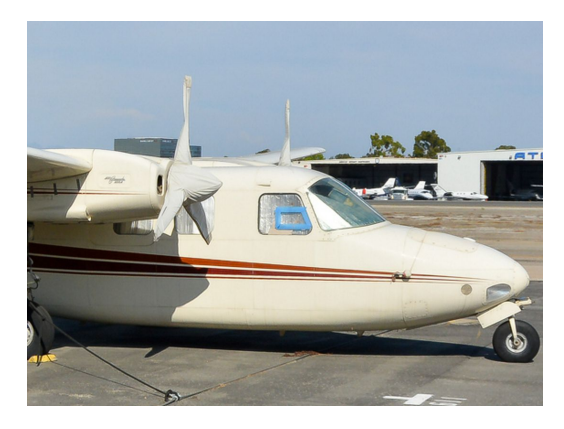
Aero Commander AC500 Ptopellor/Spinner Covers

This cover type is made from Silver Acrylic Sunbrella canvas and is 100% lined with a soft and smooth microfiber. Bruce's Custom Covers developed this material combination especially for aircraft protection. The outer material is medium weight and treated for water resistance, UV resistance and anti-static buildup. The inner lining is a very soft and smooth microfiber to prevent scratching. The material is very reflective, and tests show that the cabin interior temperature can be reduced to near-ambient temperature on the hottest of days. It is water, ice and snow repellent, yet breathable to allow moisture to escape from between the cover and the aircraft surface.