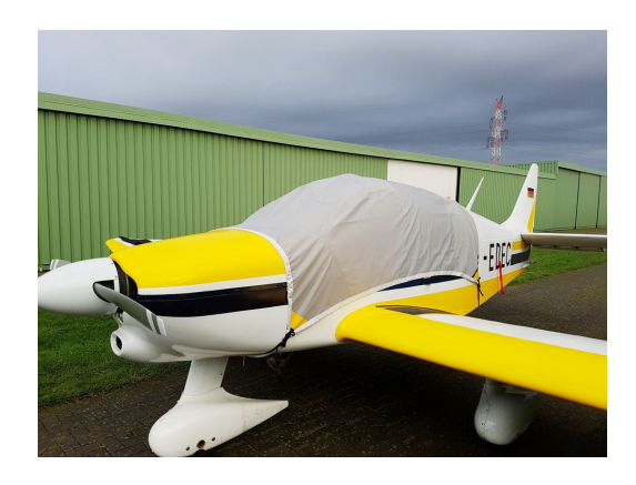
Robin DR400/R Travel Cover, Light Weight Travel Canopy Cover