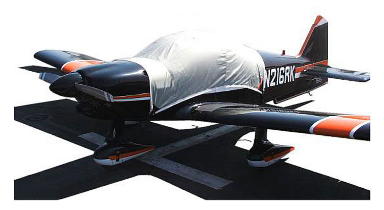
Robin R.2160 Canopy Cover