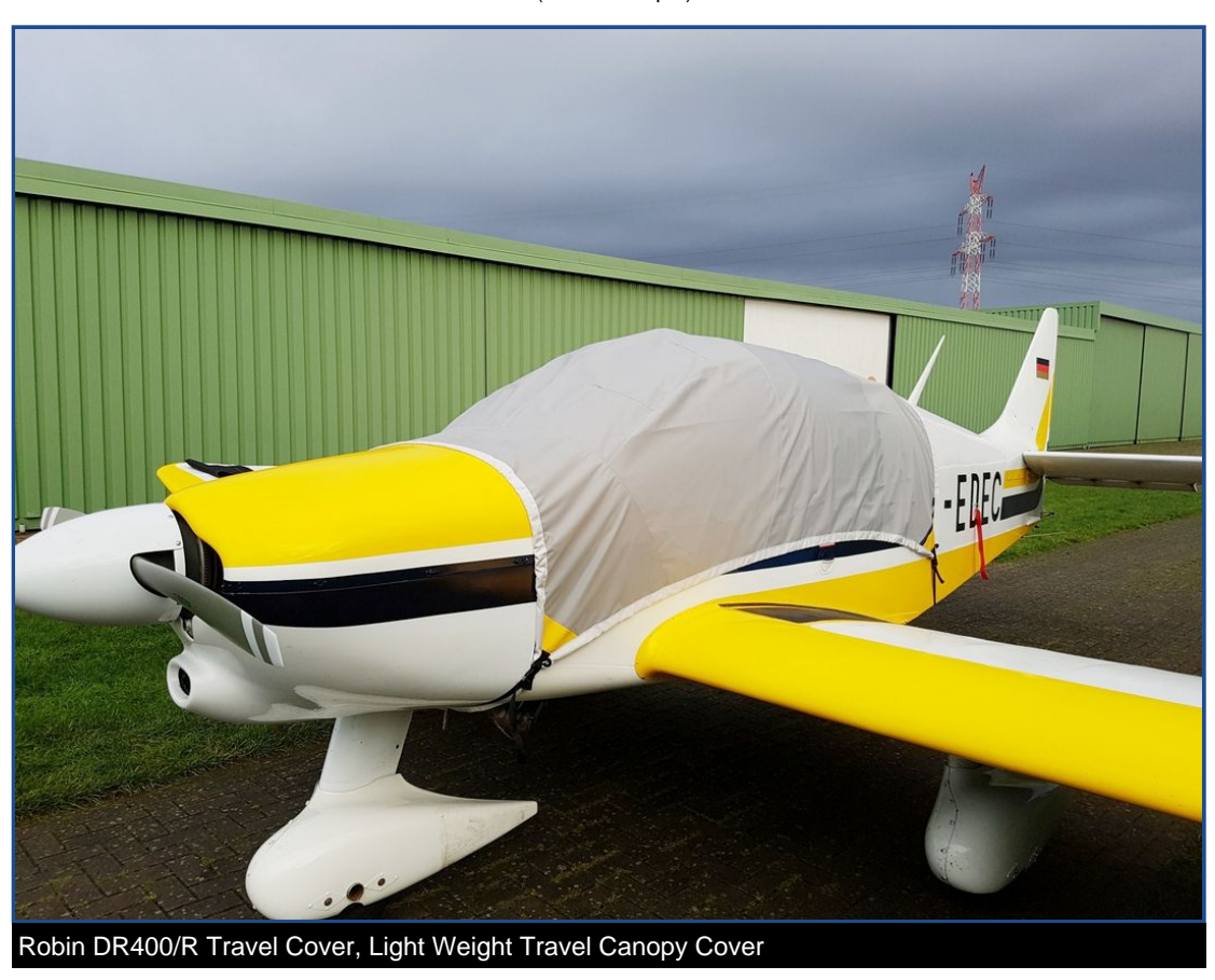
Section 1: Canopy/Cockpit/Fuselage Covers

Canopy Covers help reduce damage to your airplane's upholstery and avionics caused by excessive heat, and they can eliminate problems caused by leaking door and window seals. They keep the windshield and window surfaces clean and help prevent vandalism and theft.