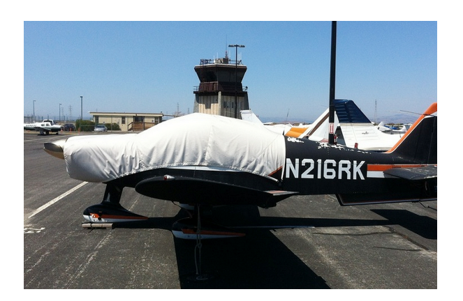
Robin Canopy/Engine Cover