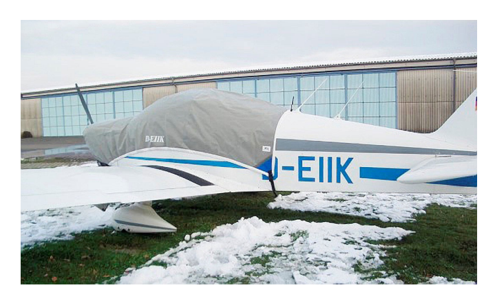
Robin R.2160 Canopy/Engine Cover