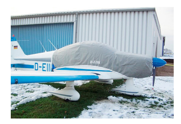
Robin R.2160 Canopy/Engine Cover

The Robin DR200 & related Canopy/Engine Cover is a one-piece cover (100% lined with microfiber) that is a combination of the Canopy Cover and Engine Cover. This cover will enclose the engine cowl and will extend aft to cover all of the windows. This cover type is made from Silver Acrylic Sunbrella canvas and is 100% lined with a soft and smooth microfiber. Bruce's Custom Covers developed this material combination especially for aircraft protection. The outer material is medium weight and treated for water resistance, UV resistance and anti-static buildup. The inner lining is a very soft and smooth microfiber to prevent scratching. The material is very reflective, and tests show that the cabin interior temperature can be reduced to near-ambient temperature on the hottest of days. It is water, ice and snow repellent, yet breathable to allow moisture to escape from between the cover and the aircraft surface.