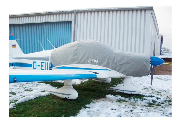
Robin R.2160 Canopy/Engine Cover