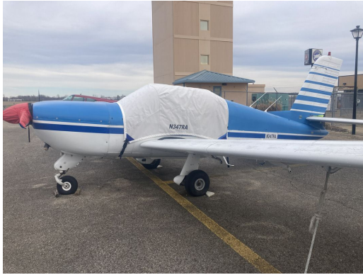
SOCATA Rallye 150 Canopy Cover, Prop Cover

The Aerospatiale (Socata) Rallye 150 Canopy/Engine Cover is a one-piece cover (100% lined with microfiber) that is a combination of the Canopy Cover and Engine Cover. This cover will enclose the engine cowl and will extend aft to cover all of the windows. This cover type is made from Silver Acrylic Sunbrella canvas and is 100% lined with a soft and smooth microfiber. Bruce's Custom Covers developed this material combination especially for aircraft protection. The outer material is medium weight and treated for water resistance, UV resistance and anti-static buildup. The inner lining is a very soft and smooth microfiber to prevent scratching. The material is very reflective, and tests show that the cabin interior temperature can be reduced to near-ambient temperature on the hottest of days. It is water, ice and snow repellent, yet breathable to allow moisture to escape from between the cover and the aircraft surface.