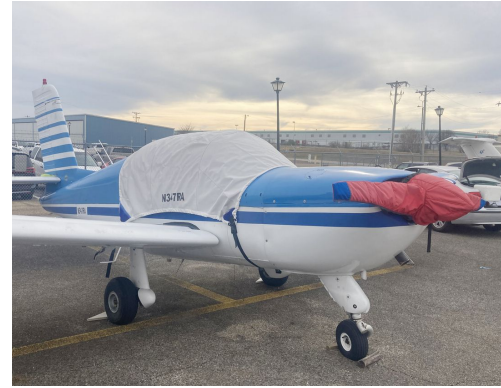
SOCATA Rallye 150 Canopy Cover, Prop Cover