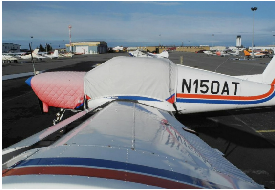
Koliber 150A Canopy Cover, Insulated Engine Cover

This cover type is made from Silver Acrylic Sunbrella canvas and is 100% lined with a soft and smooth microfiber. Bruce's Custom Covers developed this material combination especially for aircraft protection. The outer material is medium weight and treated for water resistance, UV resistance and anti-static buildup. The inner lining is a very soft and smooth microfiber to prevent scratching. The material is very reflective, and tests show that the cabin interior temperature can be reduced to near-ambient temperature on the hottest of days. It is water, ice and snow repellent, yet breathable to allow moisture to escape from between the cover and the aircraft surface.