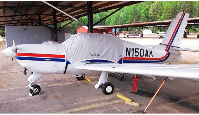
Rallye Canopy Cover