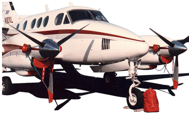
Pitot, Exhaust Covers, Engine Plugs & Prop Ties