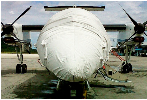
De Havilland Dash 8 Cockpit/Nose Cover