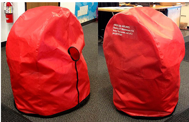
Boeing 757 Tire Covers, great for Wash Prep or Storage

ALL-YEAR USE MATERIAL - Made with Silver Acrylic Sunbrella canvas, the all-year use material is the best option for sun protection and cover longevity. This heavier more durable material is intended for all weather conditions, such as rain and snow or lots of sun.