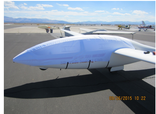
DG-505 Canopy/Nose Cover (test fit cover)