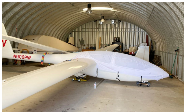
PZL Swidnik PW6 Canopy/Nose Cover