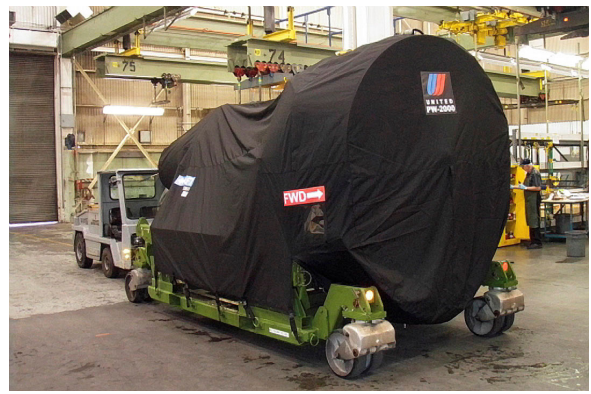
PW 2000 Series OFF-LINK ENGINE STORAGE COVER, Rain Cap