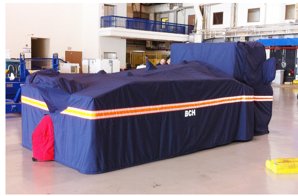
Complete Cover for Eagle Tug