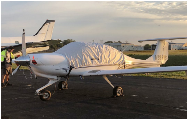
Diamond DA-40 Canopy Cover & Engine Plugs