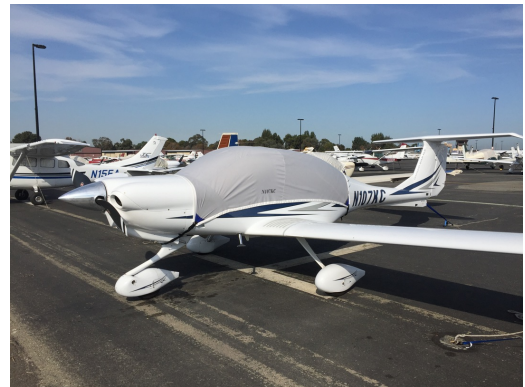
Diamond DA-40 Travel Cover, Light Weight Travel Canopy Cover