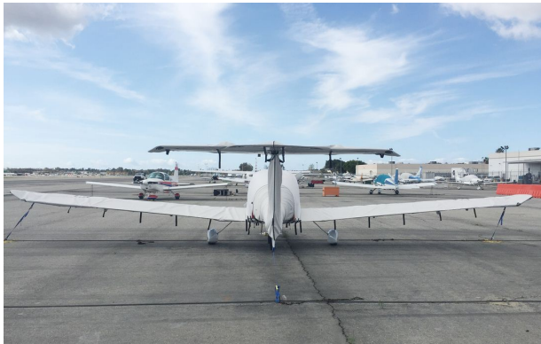
Diamond DA-40 Full Cover Set