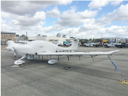
Diamond DA-40 Full Cover Set