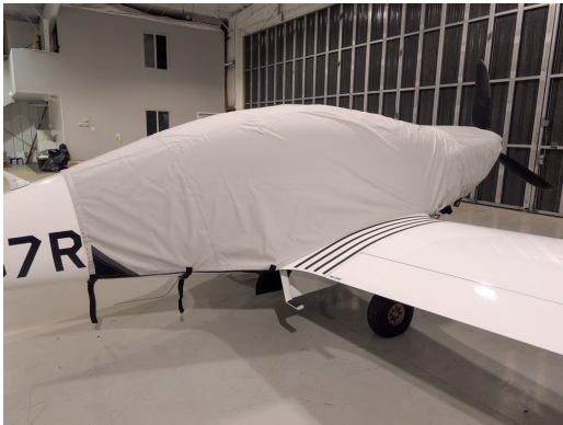
Pipistrel Panthera Extended Canopy/Engine Cover

This cover type is made from Silver Acrylic Sunbrella canvas and is 100% lined with a soft and smooth microfiber. Bruce's Custom Covers developed this material combination especially for aircraft protection. The outer material is medium weight and treated for water resistance, UV resistance and anti-static buildup. The inner lining is a very soft and smooth microfiber to prevent scratching. The material is very reflective, and tests show that the cabin interior temperature can be reduced to near-ambient temperature on the hottest of days. It is water, ice and snow repellent, yet breathable to allow moisture to escape from between the cover and the aircraft surface.