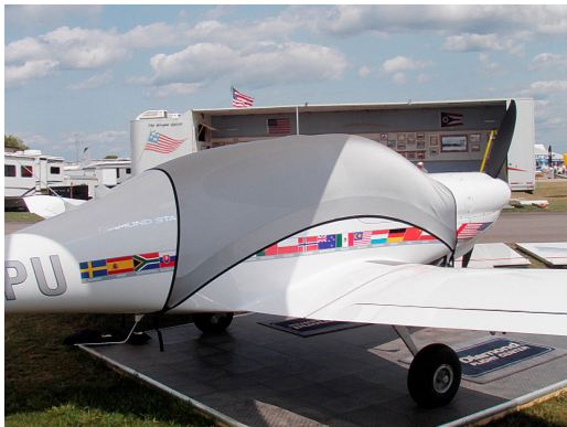
Diamond DA-40 Light Weight Travel Cover (Spandex Flyaway Type)

Travel Covers are made with Silver Solution-Dyed Polyester fabric and only lined over the windshield to save weight. The material is lightweight and more compact for easy stowage in the aircraft. The polyester material is water resistant, but only intended for occasional use outside. We also have an ultra lightweight material available for fitted hangar dust covers. For daily outdoor use, the non-travel Sunbrella Cover is the best choice.