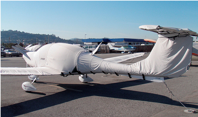
Diamond DA-40 Full Cover Set

WINTER USE MATERIAL - Made with Solution-Dyed Polyester fabric, this option is intended for seasonal use to aid in deicing, rain mitigation, or for occasional travel. The material is lighter and more compact, but more susceptible to UV damage and may have a shorter useful life if used continuously outside than the all-year use material.