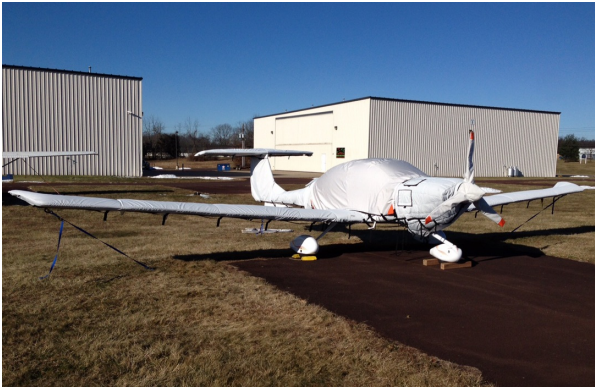
Diamond DA40 Canopy, Insulated Engine, Wing and Stab. Covers Diamond DA-40 Full Cover Set, with Insulated Engine Cover