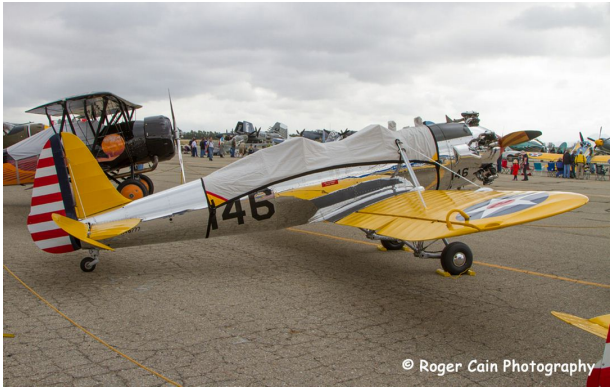
Ryan PT-22 Canopy Cover