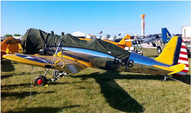
Ryan PT-22 ST3KR Canopy Cover and Engine Cover