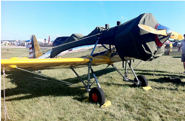
Ryan PT-22 Canopy Cover and Engine Cover

water resistance, UV resistance and anti-static buildup. The inner lining is a very soft and smooth microfiber to prevent scratching. The material is very reflective, and tests show that the cabin interior temperature can be reduced to near-ambient temperature on the hottest of days. It is water, ice and snow repellent, yet breathable to allow moisture to escape from between the cover and the aircraft surface.