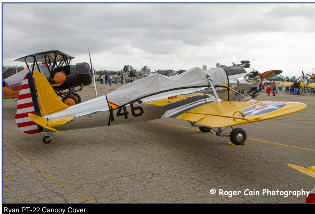
Ryan PT-22 Canopy Cover