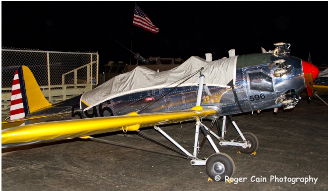
Ryan PT-22 Canopy Cover