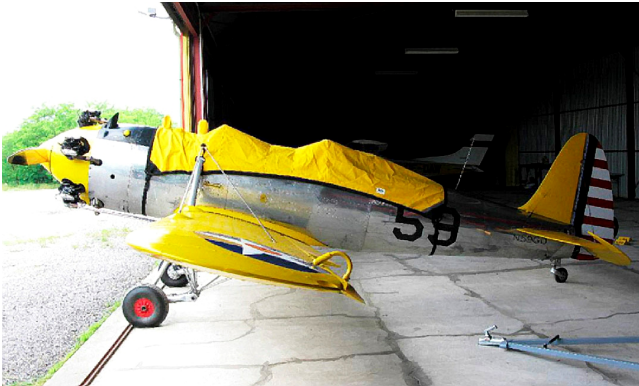
Ryan PT-22 Canopy Cover

Travel Covers are made with Silver Solution-Dyed Polyester fabric and only lined over the windshield to save weight. The material is lightweight and more compact for easy stowage in the aircraft. The polyester material is water resistant, but only intended for occasional use outside. We also have an ultra lightweight material available for fitted hangar dust covers. For daily outdoor use, the non-travel Sunbrella Cover is the best choice.