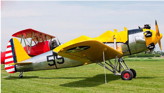
The Ryan PT-22 Canopy Cover

This cover type is made from Silver Acrylic Sunbrella canvas and is 100% lined with a soft and smooth microfiber. Bruce's Custom Covers developed this material combination especially for aircraft protection. The outer material is medium weight and treated for water resistance, UV resistance and anti-static buildup. The inner lining is a very soft and smooth microfiber to prevent scratching. The material is very reflective, and tests show that the cabin interior temperature can be reduced to near-ambient temperature on the hottest of days. It is water, ice and snow repellent, yet breathable to allow moisture to escape from between the cover and the aircraft surface.