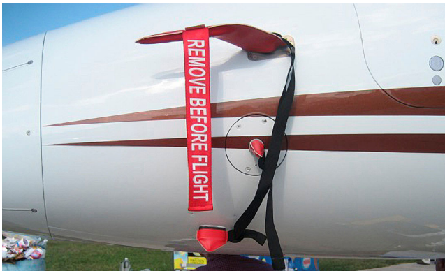
Premier Heat Resistant Pitot Covers set

The Hawker Beechcraft Premier 390 Intake/Exhaust Plugs are custom fit for the intake and exhaust openings, made with heavy-duty vinyl material, and stuffed with a single block of sculpted urethane foam. Each plug has a zipper that allows the foam to be removed and dried if necessary. Engine plugs have 'remove before flight' streamers sewn onto the face of the plugs. Most plugs are imprinted with the aircraft registration number in black. Engine plugs may be inserted after flight when the engine is still warm. Engine Inlet Plugs are commonly referred to as Cowl Plugs, Intake Plugs, Cowl Blocks, Engine Blocks, and Engine Bungs.