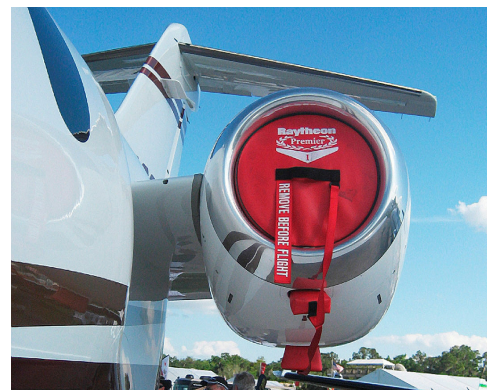
Hawker Beechcraft Premier 390 Intake Plug/Exhaust Plug Set Premier Intake/Exhaust Plug set with Generator Inlet/Exhaust Plugs