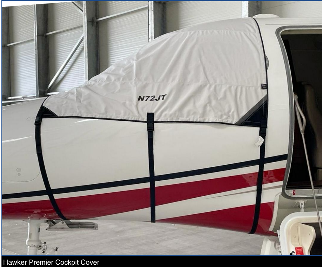
Hawker Premier Cockpit Cover