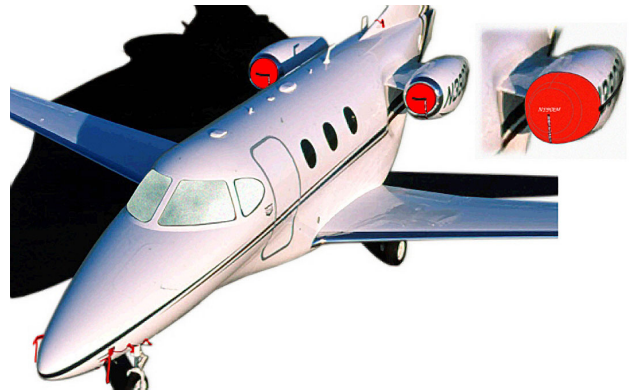
Premier Intake Plugs, Intake Covers, Pitot Covers & Cockpit HeatShields