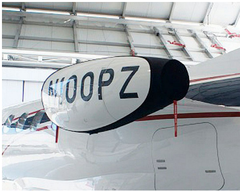
Phenom 100 "Bikini" Engine Covers

imprinted with the aircraft registration number in black. Engine plugs may be inserted after flight when the engine is still warm. Engine Inlet Plugs are commonly referred to as Cowl Plugs, Intake Plugs, Cowl Blocks, Engine Blocks, and Engine Bungs.