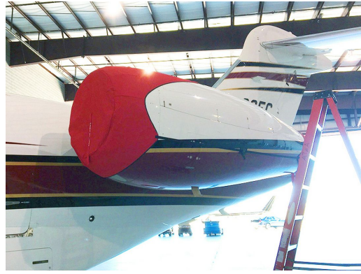
Hawker Beechcraft Premier Engine Covers, 3-Strap Style