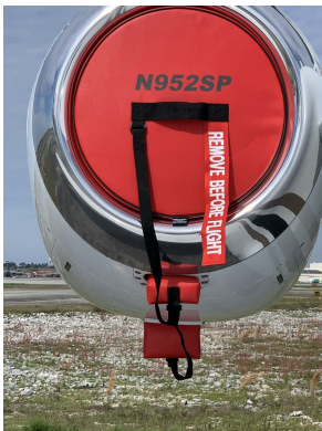
Beech Premier 1A Intake/Exhaust Plug Set