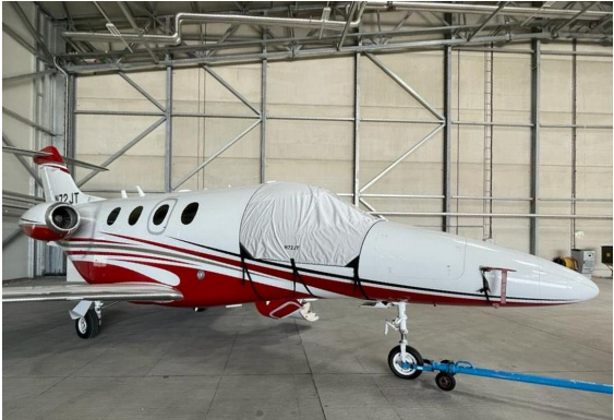
Hawker Premier Cockpit Cover