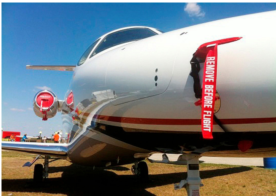
Premier Heat Resistant Pitot Covers set & Engine Intake Plugs

The Hawker Beechcraft Premier 390 Intake/Exhaust Plugs are custom fit for the intake and exhaust openings, made with heavy-duty vinyl material, and stuffed with a single block of sculpted urethane foam. Each plug has a zipper that allows the foam to be removed and dried if necessary. Engine plugs have 'remove before flight' streamers sewn onto the face of the plugs. Most plugs are imprinted with the aircraft registration number in black. Engine plugs may be inserted after flight when the engine is still warm. Engine Inlet Plugs are commonly referred to as Cowl Plugs, Intake Plugs, Cowl Blocks, Engine Blocks, and Engine Bungs.