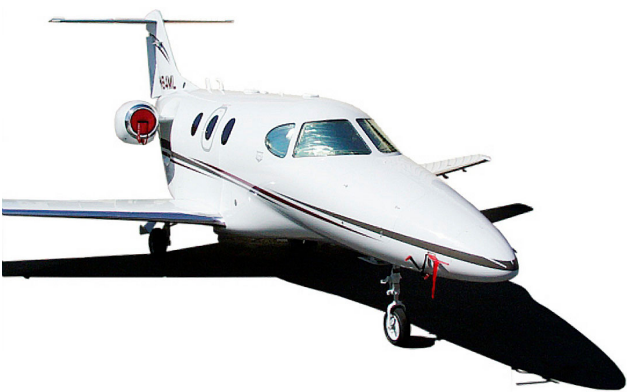
Raytheon Premier Intake Plugs, Pitot Covers & Cockpit HeatShields