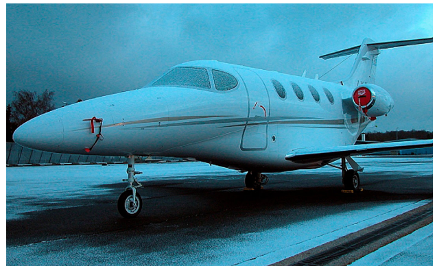
Premier Intake Plugs & Pitot Covers