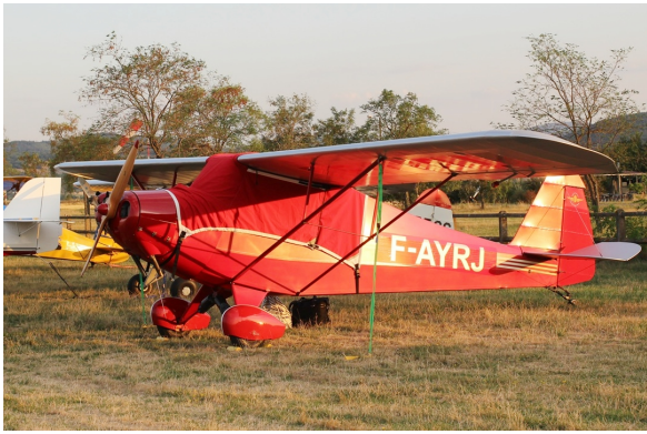
Porterfield Collegiate Canopy Cover