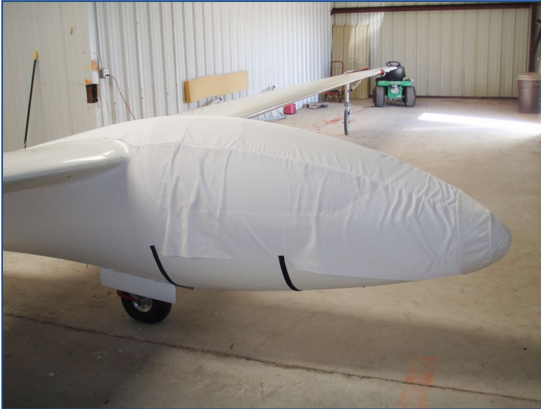
Bolkow Phoebus C-1 Canopy/Nose Cover, test fit cover