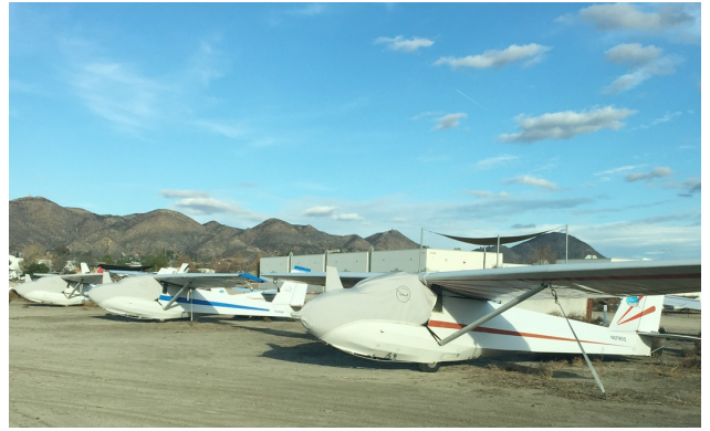
Schweizer SGS 2-33 Canopy/Nose Covers