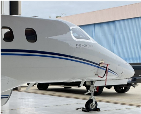
Embraer EMB-505 Pitot Cover Set