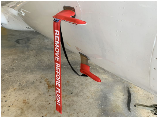
Embraer Phenom 300 Pitot Covers

The Engine Inlet Plugs are custom fit for your Embraer Phenom 300 (EMB-505) intakes, made with heavy-duty vinyl material, and stuffed with a single block of sculpted urethane foam. Each plug has a zipper that allows the foam to be removed and dried if necessary. Engine plugs have 'remove before flight' streamers sewn onto the face of the plugs. Most plugs are imprinted with the aircraft registration number in black for an extra charge. Storage bag NOT included. Engine plugs may be inserted after flight when the engine is still warm. Engine Inlet Plugs are commonly referred to as Cowl Plugs, Intake Plugs, Cowl Blocks, Engine Blocks, and Engine Bungs.