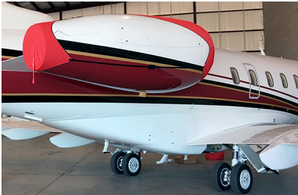
Intake/Exhaust Covers, 3-Strap Type. Successfully installed by two crew, one ladder.

The Embraer Phenom 300 (EMB-505) Intake/Exhaust Plugs are custom fit for the intake and exhaust openings, made with heavy-duty vinyl material, and stuffed with a single block of sculpted urethane foam. Each plug has a zipper that allows the foam to be removed and dried if necessary. Engine plugs have 'remove before flight' streamers sewn onto the face of the plugs. Most plugs are imprinted with the aircraft registration number in black. Engine plugs may be inserted after flight when the engine is still warm. Engine Inlet Plugs are commonly referred to as Cowl Plugs, Intake Plugs, Cowl Blocks, Engine Blocks, and Engine Bungs.