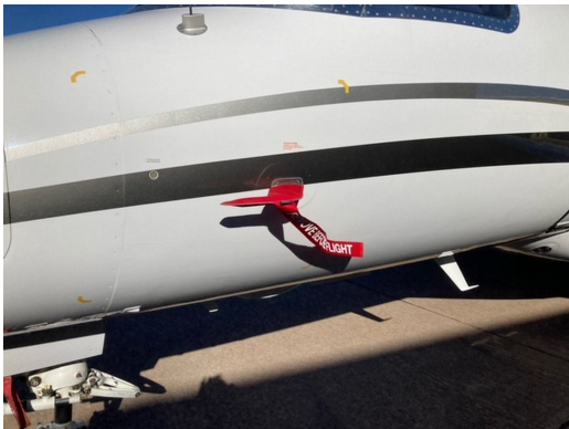
Embraer Phenom 300 (EMB-505) Heat Resistant Pitot Covers

the engine is still warm. Engine Inlet Plugs are commonly referred to as Cowl Plugs, Intake Plugs, Cowl Blocks, Engine Blocks, and Engine Bung.