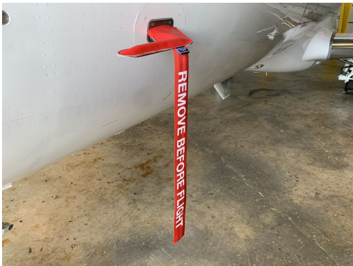
Embraer Phenom 300 Pitot Covers