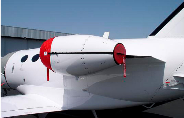
Cessna Mustang Intake/Exhaust Plug Set

The Engine Inlet Plugs are custom fit for your Embraer Phenom 300 (EMB-505) intakes, made with heavy-duty vinyl material, and stuffed with a single block of sculpted urethane foam. Each plug has a zipper that allows the foam to be removed and dried if necessary. Engine plugs have 'remove before flight' streamers sewn onto the face of the plugs. Most plugs are imprinted with the aircraft registration number in black for an extra charge. Storage bag NOT included. Engine plugs may be inserted after flight when the engine is still warm. Engine Inlet Plugs are commonly referred to as Cowl Plugs, Intake Plugs, Cowl Blocks, Engine Blocks, and Engine Bungs.