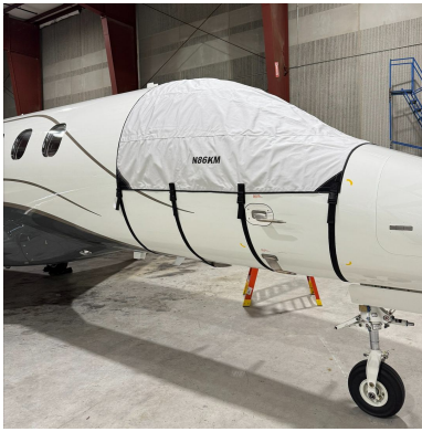
Phenom 300 Cockpit Cover