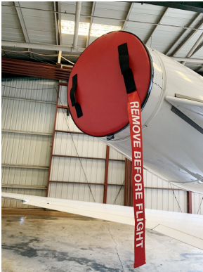
Embraer Phenom 300 Exhaust Plugs

necessary. Engine plugs have 'remove before flight' streamers sewn onto the face of the plugs. Most plugs are imprinted with the aircraft registration number in black for an extra charge. Storage bag NOT included. Engine plugs may be inserted after flight when the engine is still warm. Engine Inlet Plugs are commonly referred to as Cowl Plugs, Intake Plugs, Cowl Blocks, Engine Blocks, and Engine Bungs.