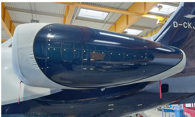
Phenom 300 Bikini Type Engine Cover

The Embraer Phenom 300 (EMB-505) Intake/Exhaust Plugs are custom fit for the intake and exhaust openings, made with heavy-duty vinyl material, and stuffed with a single block of sculpted urethane foam. Each plug has a zipper that allows the foam to be removed and dried if necessary. Engine plugs have 'remove before flight' streamers sewn onto the face of the plugs. Most plugs are imprinted with the aircraft registration number in black. Engine plugs may be inserted after flight when the engine is still warm. Engine Inlet Plugs are commonly referred to as Cowl Plugs, Intake Plugs, Cowl Blocks, Engine Blocks, and Engine Bungs.