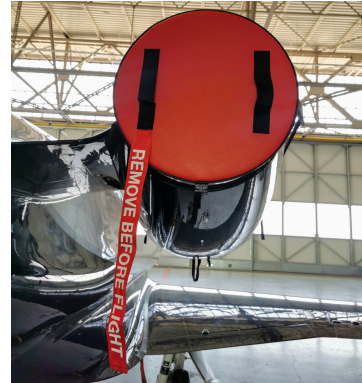
Embraer Phenom 300 ENGINE INLET COVERS & EXHAUST PLUGS (includes lower nacelle plug) (set of 6)