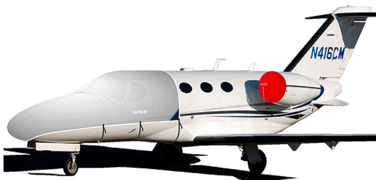
Citation Mustang Cockpit/Door/Nose Cover, Engine Inlet Cover