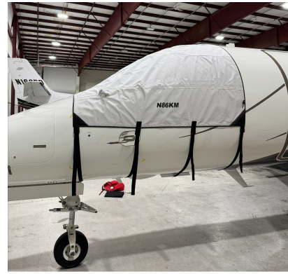
Phenom 300 Cockpit Cover