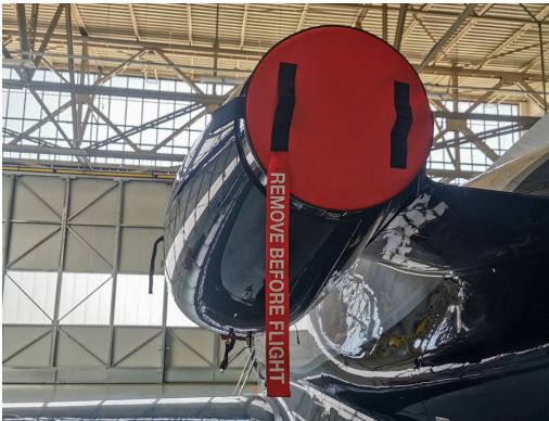
Embraer Phenom 300 ENGINE INLET COVERS & EXHAUST PLUGS (includes lower nacelle plug) (set of 6)