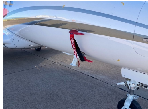
Embraer Phenom 300 (EMB-505) Heat Resistant Pitot Covers