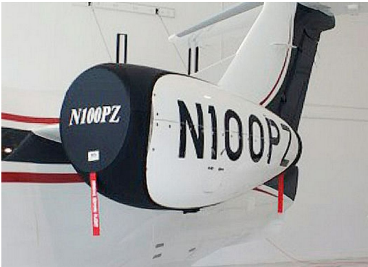
Phenom 100 "Bikini" Engine Covers