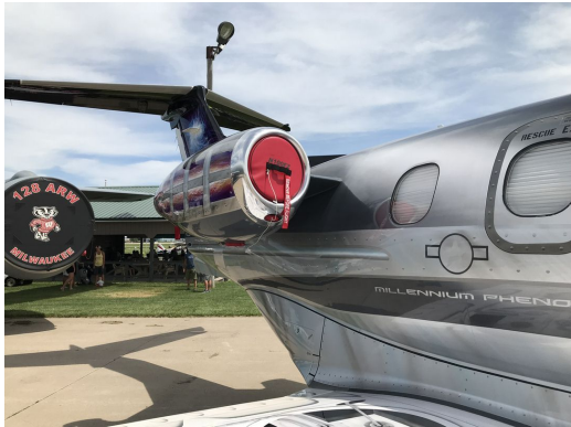
Embraer Phenom I Engine Inlet Plugs

The Engine Inlet Plugs are custom fit for your Embraer Phenom 100 (EMB-500) intakes, made with heavy-duty vinyl material, and stuffed with a single block of sculpted urethane foam. Each plug has a zipper that allows the foam to be removed and dried if necessary. Engine plugs have 'remove before flight' streamers sewn onto the face of the plugs. Most plugs are imprinted with the aircraft registration number in black for an extra charge. Storage bag NOT included. Engine plugs may be inserted after flight when the engine is still warm. Engine Inlet Plugs are commonly referred to as Cowl Plugs, Intake Plugs, Cowl Blocks, Engine Blocks, and Engine Bungs.