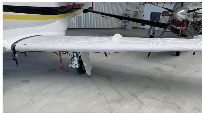
Embraer Phenom 100 Canopy/Nose Cover