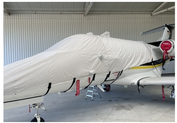
Embraer Phenom 100 Canopy/Nose Cover