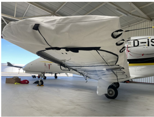
Embraer Phenom 100 Canopy/Nose Cover