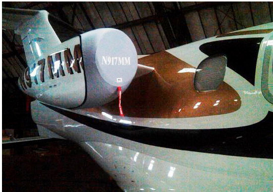
Phenom 100 Intake/Exhaust Cover, "Bikini" Type

Engine Inlet Plugs are commonly referred to as Cowl Plugs, Intake Plugs, Cowl Blocks, Engine Blocks, and Engine Bungs.