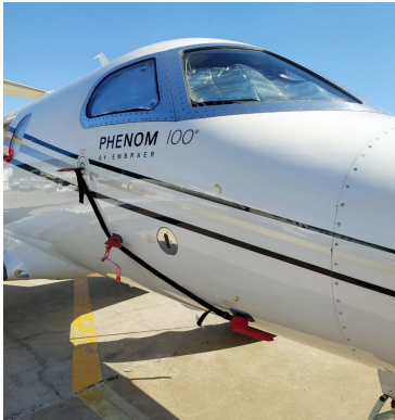
Phenom 100 (EMB 500) Pitot Cover/AOA Set