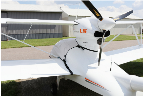
Scoda Aeronautica Super Petrel Canopy/Nose Cover