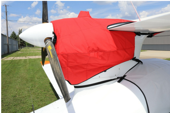
Scoda Aeronautica Super Petrel Insulated Engine Cover

Insulated Covers Material - A special composite material of solution-dyed polyester, 3M Thinsulate insulation, and soft nylon interior fabric. Our insulated covers are designed to complement an engine preheater and help retain heat in the engine compartment after shutdown. If you operate your aircraft in cold-weather, these covers will help prevent engine wear and tear.