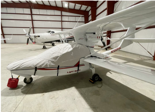
Scoda Super Petrel Canopy/Nose Cover

Travel Covers are made with Silver Solution-Dyed Polyester fabric and only lined over the windshield to save weight. The material is lightweight and more compact for easy stowage in the aircraft. The polyester material is water resistant, but only intended for occasional use outside. We also have an ultra lightweight material available for fitted hangar dust covers. For daily outdoor use, the non-travel Sunbrella Cover is the best choice.