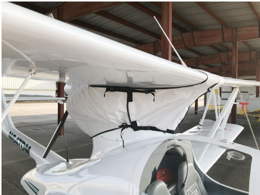
Scoda Aeronautica Super Petrel Engine Cover