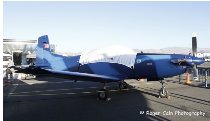
Pilatus PC-7 Canopy Cover