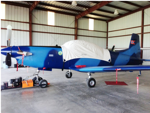
Pilatus PC-7 Canopy Cover

Travel Covers are made with Silver Solution-Dyed Polyester fabric and only lined over the windshield to save weight. The material is lightweight and more compact for easy stowage in the aircraft. The polyester material is water resistant, but only intended for occasional use outside. We also have an ultra lightweight material available for fitted hangar dust covers. For daily outdoor use, the non-travel Sunbrella Cover is the best choice.