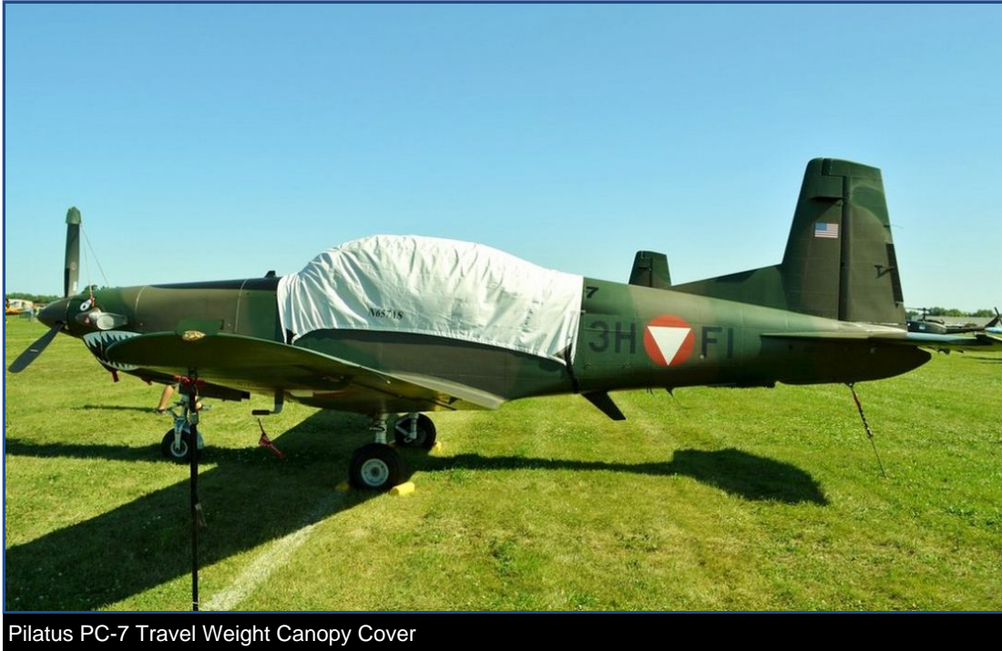
Pilatus PC-7 Travel Weight Canopy Cover