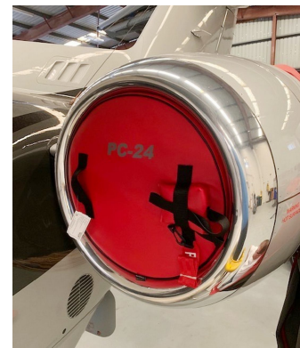
Pilatus PC-24 Engine Intake Plug