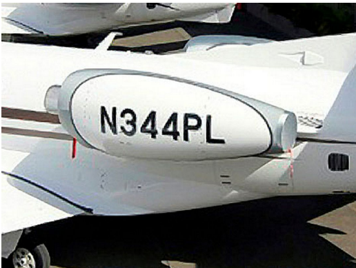
Phenom 300 "Bikini" type Engine Cover