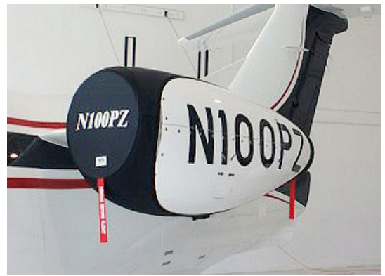
Phenom 100 "Bikini" Engine Covers