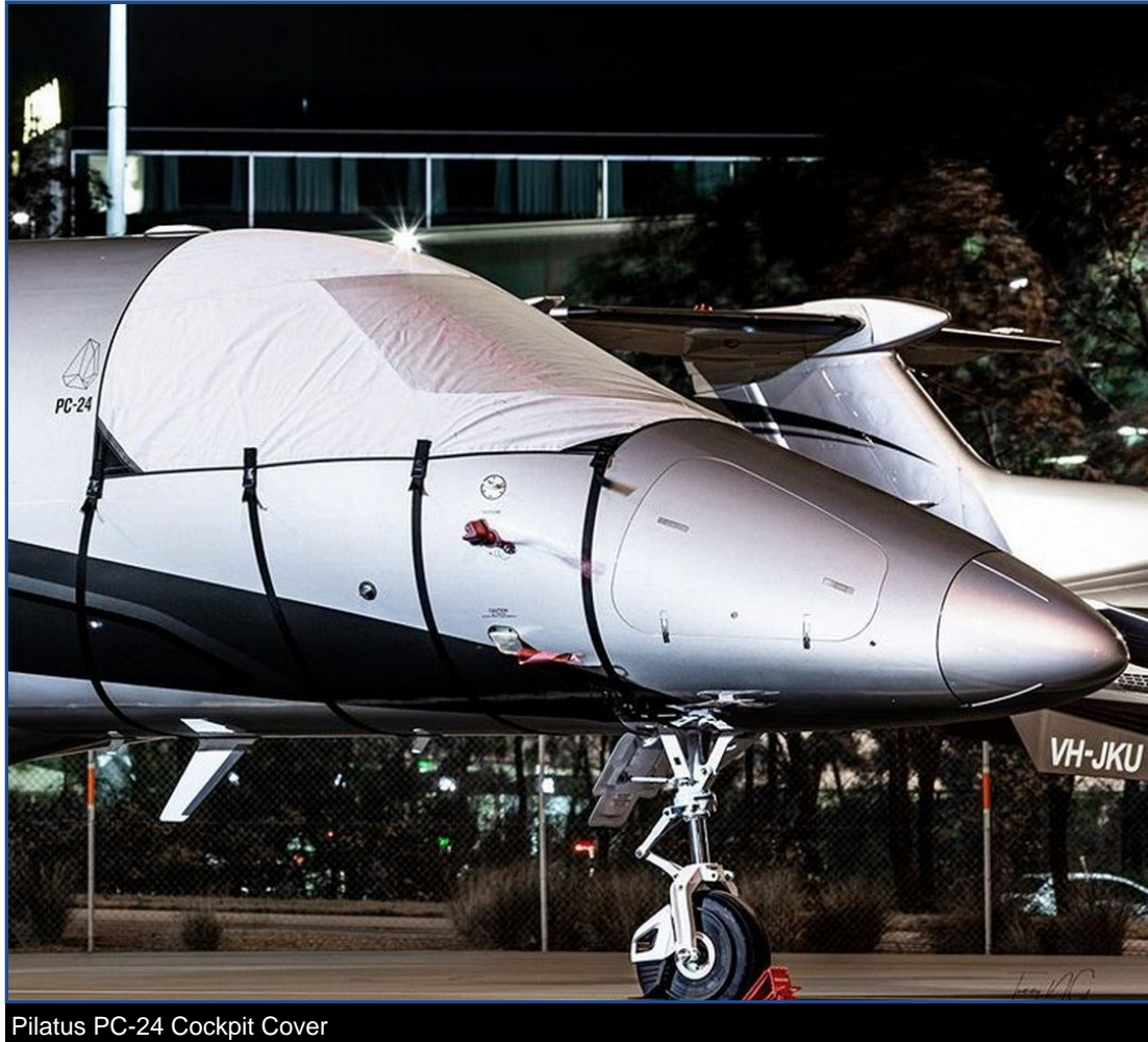
Pilatus PC-24 Cockpit Cover