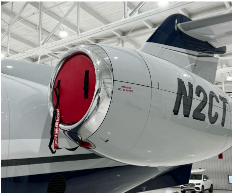
Pilatus PC-24 Engine Inlet Plugs

The Engine Inlet Plugs are custom fit for your Pilatus PC-24 intakes, made with heavy-duty vinyl material, and stuffed with a single block of sculpted urethane foam. Each plug has a zipper that allows the foam to be removed and dried if necessary. Engine plugs have 'remove before flight' streamers sewn onto the face of the plugs. Most plugs are imprinted with the aircraft registration number in black for an extra charge. Storage bag NOT included. Engine plugs may be inserted after flight when the engine is still warm. Engine Inlet Plugs are commonly referred to as Cowl Plugs, Intake Plugs, Cowl Blocks, Engine Blocks, and Engine Bungs.