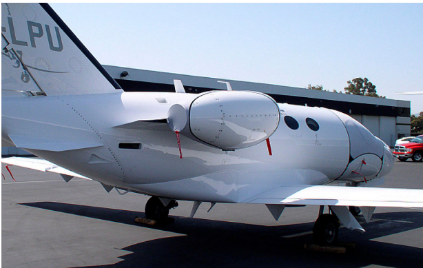
Citation Mustang Light Weight Engine Cover, Light Weight Windshield Cover, Pitot/AOA Cover

The Pilatus PC-24 Intake/Exhaust Plugs are custom fit for the intake and exhaust openings, made with heavy-duty vinyl material, and stuffed with a single block of sculpted urethane foam. Each plug has a zipper that allows the foam to be removed and dried if necessary. Engine plugs have 'remove before flight' streamers sewn onto the face of the plugs. Most plugs are imprinted with the aircraft registration number in black. Engine plugs may be inserted after flight when the engine is still warm. Engine Inlet Plugs are commonly referred to as Cowl Plugs, Intake Plugs, Cowl Blocks, Engine Blocks, and Engine Bungs.