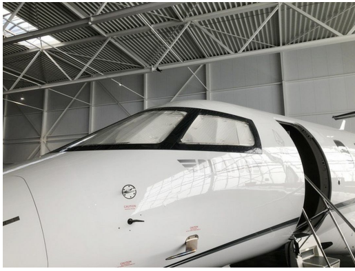
Pilatus PC-24 Cockpit HeatShields