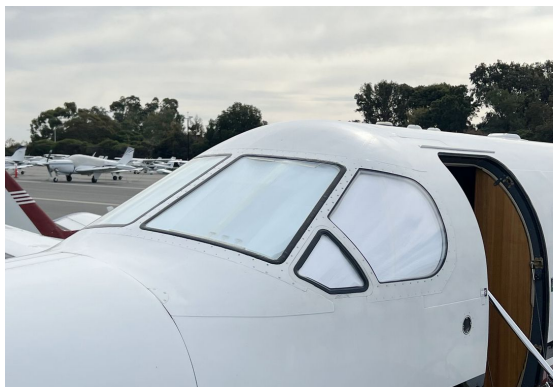
Pilatus PC-12 Cockpit HeatShields

Cockpit Heatshields are interior sunshades for the aircraft's cockpit. The product is a unique composite of closed-cell foam with a silver mylar finish. The semi-rigid design is stiff enough to stand inside the window framing. The set folds up flat and is easily stored in the included storage sleeve. Some designs may require velcro and suction cups. A Heatshield is an excellent short-term remedy for cockpit overheating, but an external fabric cover is more effective for long-term protection.