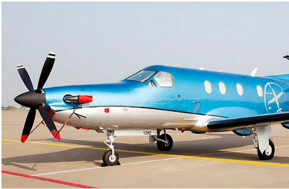
Pilatus PC-12 Prop Tie/Exhaust Covers, Plugs and HeatShields

This cover type is made from Silver Acrylic Sunbrella canvas and is 100% lined with a soft and smooth microfiber. Bruce's Custom Covers developed this material combination especially for aircraft protection. The outer material is medium weight and treated for water resistance, UV resistance and anti-static buildup. The inner lining is a very soft and smooth microfiber to prevent scratching. The material is very reflective, and tests show that the cabin interior temperature can be reduced to near-ambient temperature on the hottest of days. It is water, ice and snow repellent, yet breathable to allow moisture to escape from between the cover and the aircraft surface.