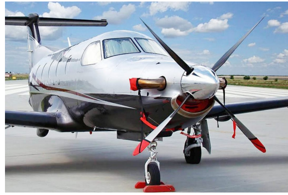
Pilatus PC-12 Engine Plugs, Prop Ties, Cockpit HeatShields