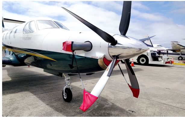
Main Intake Plug and Prop-Tie/Exhaust Covers. (Sold Separately)