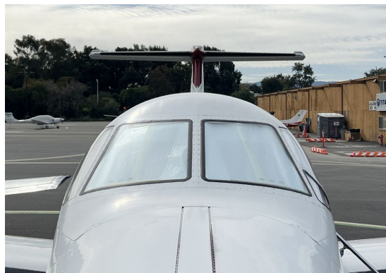
Pilatus PC-12 Cockpit HeatShields