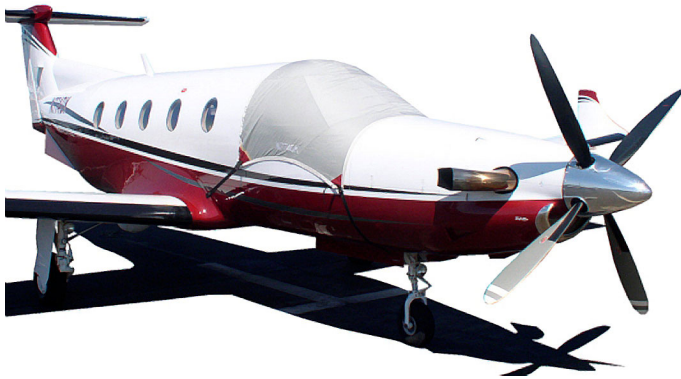
PC-12 Windshield Cover

This cover type is made from Silver Acrylic Sunbrella canvas and is 100% lined with a soft and smooth microfiber. Bruce's Custom Covers developed this material combination especially for aircraft protection. The outer material is medium weight and treated for water resistance, UV resistance and anti-static buildup. The inner lining is a very soft and smooth microfiber to prevent scratching. The material is very reflective, and tests show that the cabin interior temperature can be reduced to near-ambient temperature on the hottest of days. It is water, ice and snow repellent, yet breathable to allow moisture to escape from between the cover and the aircraft surface.