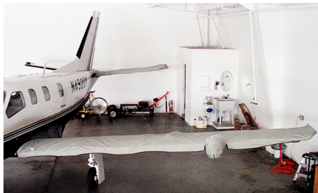
Socata TBM 700, 850 Wing and Horizontal Stabilizer Covers