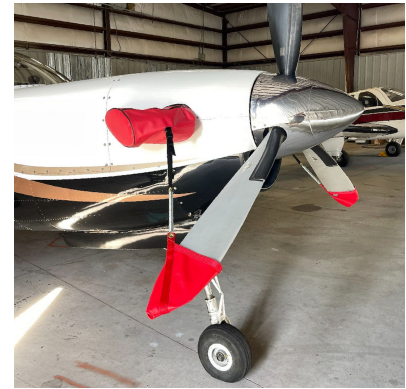
WH6 Harpoon Exhaust Covers/Prop Tie