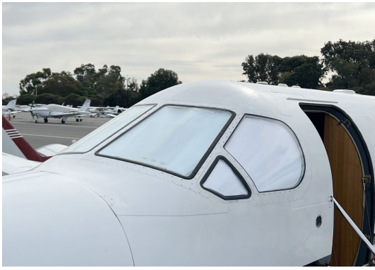
Pilatus PC-12 Cockpit HeatShields