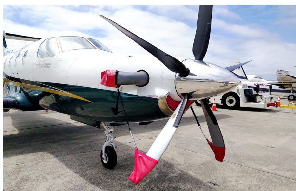
Main Intake Plug and Prop-Tie/Exhaust Covers. (Sold Separately)