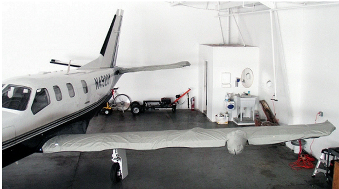
Pilatus PC-12 Wing Covers

WINTER USE MATERIAL - Made with Solution-Dyed Polyester fabric, this option is intended for seasonal use to aid in deicing, rain mitigation, or for occasional travel. The material is lighter and more compact, but more susceptible to UV damage and may have a shorter useful life if used continuously outside than the all-year use material.