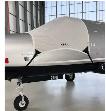
Pilatus PC-12 Cockpit Cover