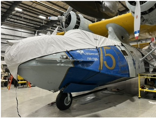
Consolidated Vultee PBX Cockpit/Nose Cover