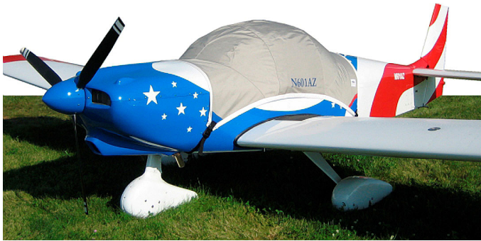
Zenith CH601 Canopy Cover

This cover type is made from Silver Acrylic Sunbrella canvas and is 100% lined with a soft and smooth microfiber. Bruce's Custom Covers developed this material combination especially for aircraft protection. The outer material is medium weight and treated for water resistance, UV resistance and anti-static buildup. The inner lining is a very soft and smooth microfiber to prevent scratching. The material is very reflective, and tests show that the cabin interior temperature can be reduced to near-ambient temperature on the hottest of days. It is water, ice and snow repellent, yet breathable to allow moisture to escape from between the cover and the aircraft surface.