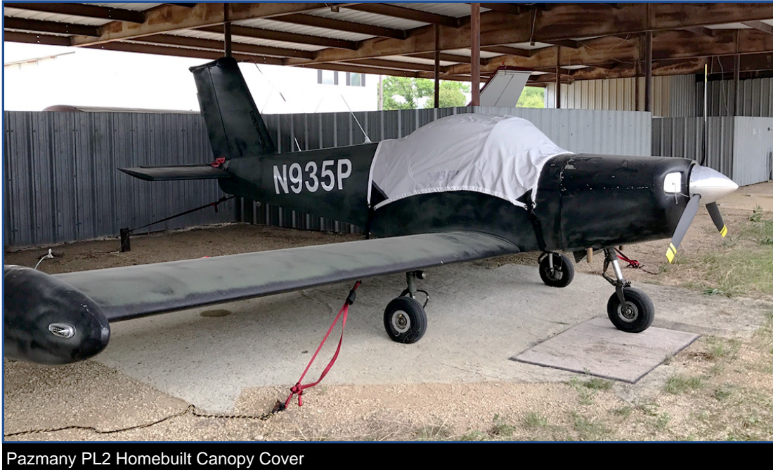
Pazmany PL2 Homebuilt Canopy Cover