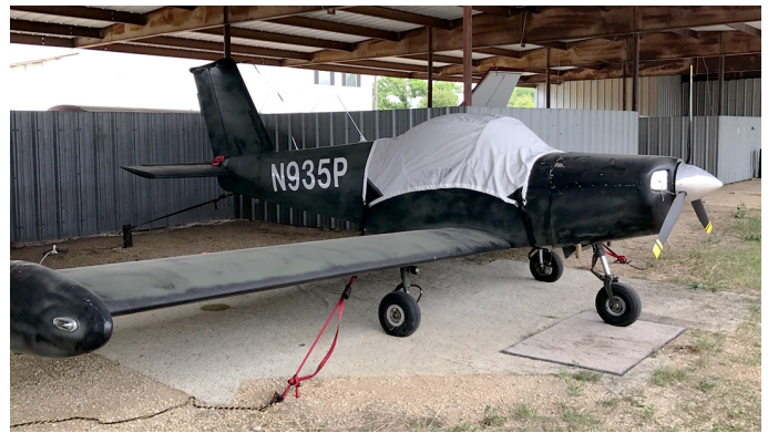
Pazmany PL2 Homebuilt Canopy Cover