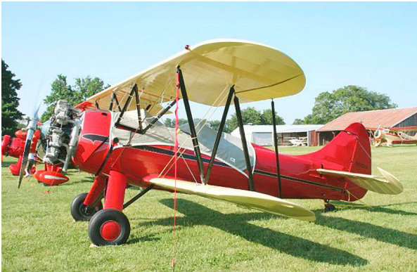
Waco YMF Canopy Cover

This cover type is made from Silver Acrylic Sunbrella canvas and is 100% lined with a soft and smooth microfiber. Bruce's Custom Covers developed this material combination especially for aircraft protection. The outer material is medium weight and treated for water resistance, UV resistance and anti-static buildup. The inner lining is a very soft and smooth microfiber to prevent scratching. The material is very reflective, and tests show that the cabin interior temperature can be reduced to near-ambient temperature on the hottest of days. It is water, ice and snow repellent, yet breathable to allow moisture to escape from between the cover and the aircraft surface.