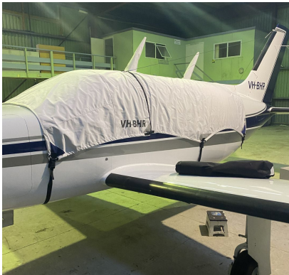
Piper PA-46 Malibu Canopy Cover