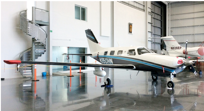
Piper PA-46 Malibu Wingtip Pads

Designed to prevent damage to the aircraft extremities in crowded hangars, these products are made of bright red Naugahyde and thickly padded with a sandwich of closed cell foam.