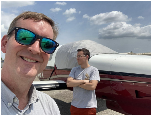
Piper Malibu/Mirage Cockpit Cover

This cover type is made from Silver Acrylic Sunbrella canvas and is 100% lined with a soft and smooth microfiber. Bruce's Custom Covers developed this material combination especially for aircraft protection. The outer material is medium weight and treated for water resistance, UV resistance and anti-static buildup. The inner lining is a very soft and smooth microfiber to prevent scratching. The material is very reflective, and tests show that the cabin interior temperature can be reduced to near-ambient temperature on the hottest of days. It is water, ice and snow repellent, yet breathable to allow moisture to escape from between the cover and the aircraft surface.