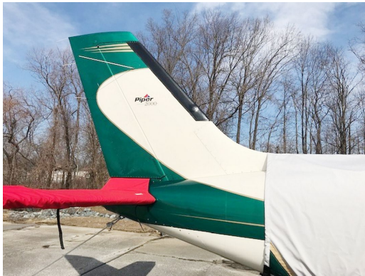
Piper Malibu/Mirage Horizontal Stabilizer/Tailcone Cover

WINTER USE MATERIAL - Made with Solution-Dyed Polyester fabric, this option is intended for seasonal use to aid in deicing, rain mitigation, or for occasional travel. The material is lighter and more compact, but more susceptible to UV damage and may have a shorter useful life if used continuously outside than the all-year use material.