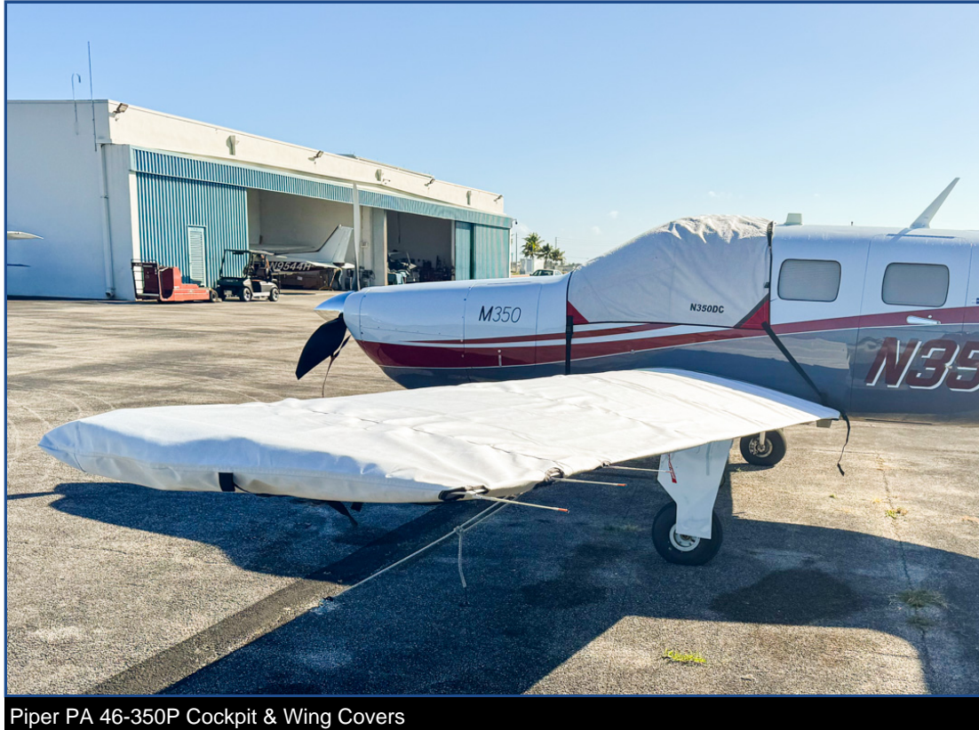
Piper PA 46-350P Cockpit &amp; Wing Covers