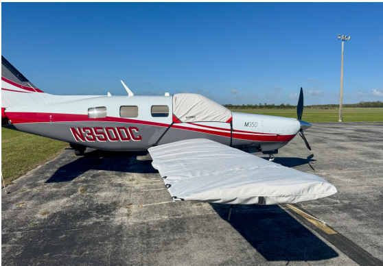
Piper PA 46-350P Cockpit & Wing Covers

WINTER USE MATERIAL - Made with Solution-Dyed Polyester fabric, this option is intended for seasonal use to aid in deicing, rain mitigation, or for occasional travel. The material is lighter and more compact, but more susceptible to UV damage and may have a shorter useful life if used continuously outside than the all-year use material.