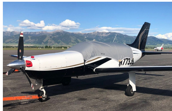
Piper PA-46 Malibu Mirage Travel Canopy Cover, Engine Plugs