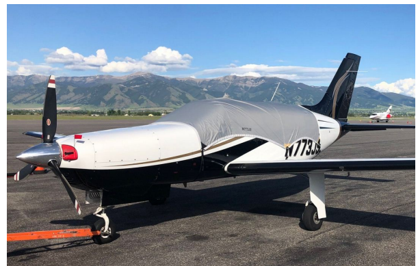
Piper PA-46 Malibu Mirage Travel Canopy Cover, Engine Plugs