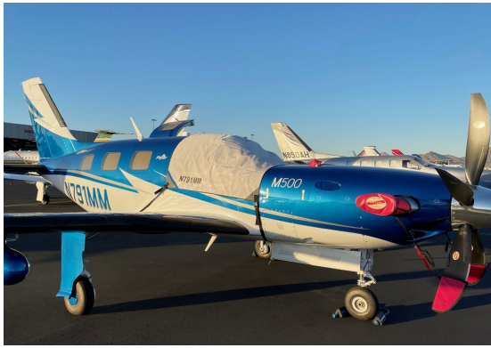
Piper M500 Cockpit Cover