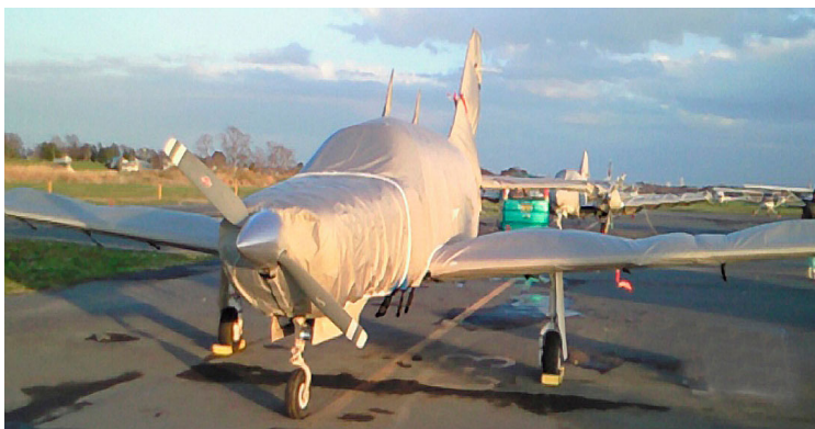
Piper PA-46 Malibu Complete Cover Set

This cover type is made from Silver Acrylic Sunbrella canvas and is 100% lined with a soft and smooth microfiber. Bruce's Custom Covers developed this material combination especially for aircraft protection. The outer material is medium weight and treated for water resistance, UV resistance and anti-static buildup. The inner lining is a very soft and smooth microfiber to prevent scratching. The material is very reflective, and tests show that the cabin interior temperature can be reduced to near-ambient temperature on the hottest of days. It is water, ice and snow repellent, yet breathable to allow moisture to escape from between the cover and the aircraft surface.