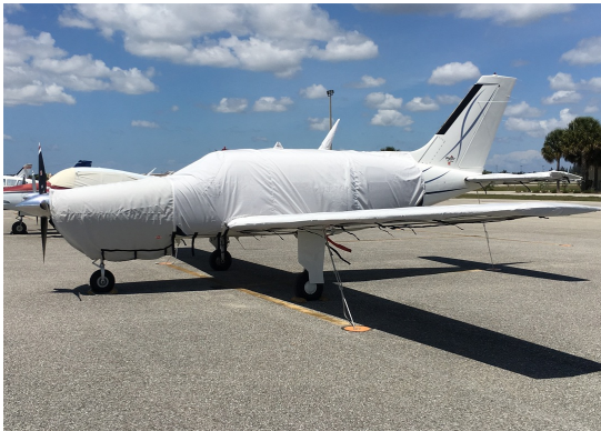
Piper Malibu Extended Canopy Cover, Engine, Wing & Horiz. Stab. Covers