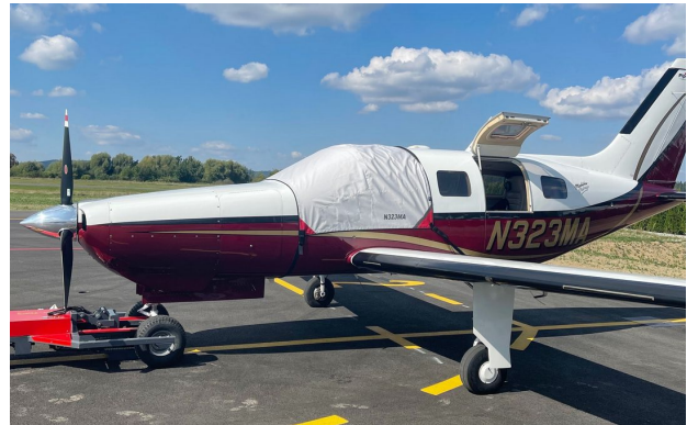
Piper Malibu/Mirage Cockpit Cover