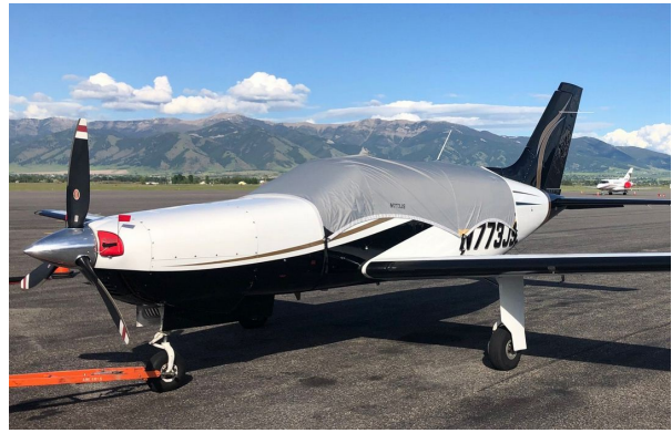
Piper PA-46 Malibu Mirage Travel Canopy Cover, Engine Plugs