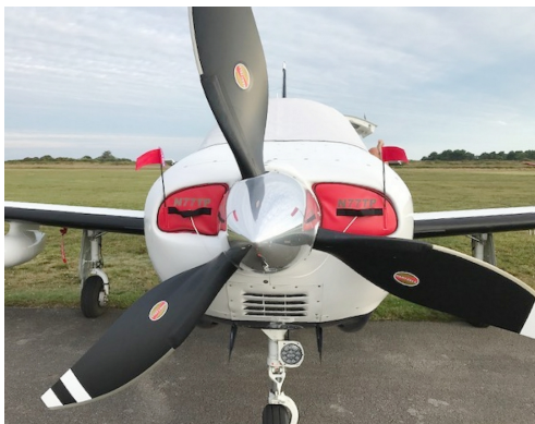
Piper PA-46-350P Mirage, Matrix, JetProp Engine Inlet Plugs

Engine Inlet Plugs are custom fit for your Piper PA-46 Malibu intakes, made with heavy-duty vinyl material, and stuffed with a single block of sculpted urethane foam. Each plug has a zipper that allows the foam to be removed and dried if necessary. Engine plugs have warning flags that are visible from the cockpit or 'remove before flight' streamers sewn onto the face of the plugs. Most plugs are imprinted with the aircraft registration number in black for an extra charge. Storage bag NOT included. Engine plugs may be inserted after flight when the engine is still warm. Engine Inlet Plugs are commonly referred to as Cowl Plugs, Intake Plugs, Cowl Blocks, Engine Blocks, and Engine Bungs.