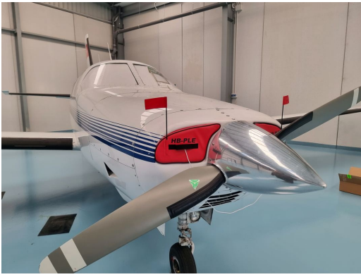
Piper PA-46 Malibu Engine Inlet Plugs