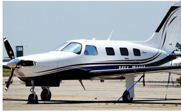
Piper PA-46-350P Mirage, Matrix, JetProp Cockpit Heatshields