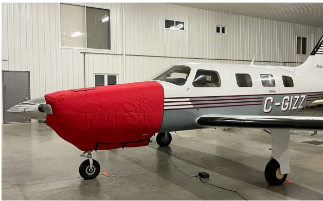
Malibu PA-46-310P Insulated Engine Cover

This cover type is made from Silver Acrylic Sunbrella canvas and is 100% lined with a soft and smooth microfiber. Bruce's Custom Covers developed this material combination especially for aircraft protection. The outer material is medium weight and treated for water resistance, UV resistance and anti-static buildup. The inner lining is a very soft and smooth microfiber to prevent scratching. The material is very reflective, and tests show that the cabin interior temperature can be reduced to near-ambient temperature on the hottest of days. It is water, ice and snow repellent, yet breathable to allow moisture to escape from between the cover and the aircraft surface.