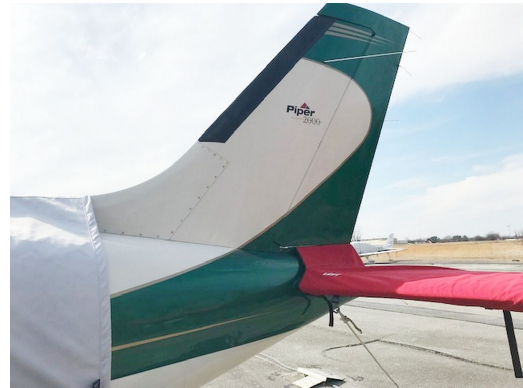
Piper Malibu/Mirage Horizontal Stabilizer/Tailcone Cover