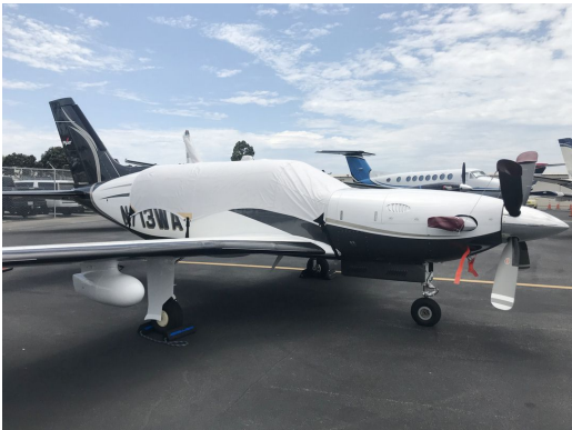
Piper Meridian Canopy Cover

This cover type is made from Silver Acrylic Sunbrella canvas and is 100% lined with a soft and smooth microfiber. Bruce's Custom Covers developed this material combination especially for aircraft protection. The outer material is medium weight and treated for water resistance, UV resistance and anti-static buildup. The inner lining is a very soft and smooth microfiber to prevent scratching. The material is very reflective, and tests show that the cabin interior temperature can be reduced to near-ambient temperature on the hottest of days. It is water, ice and snow repellent, yet breathable to allow moisture to escape from between the cover and the aircraft surface.