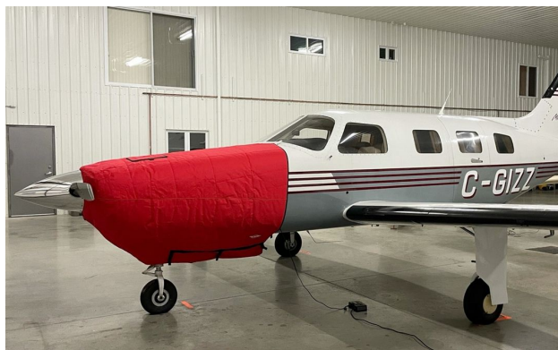
Malibu PA-46-310P Insulated Engine Cover