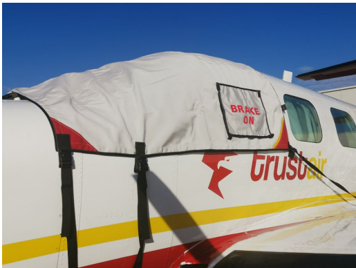
Piper PA-42 Cheyenne III Cockpit Cover