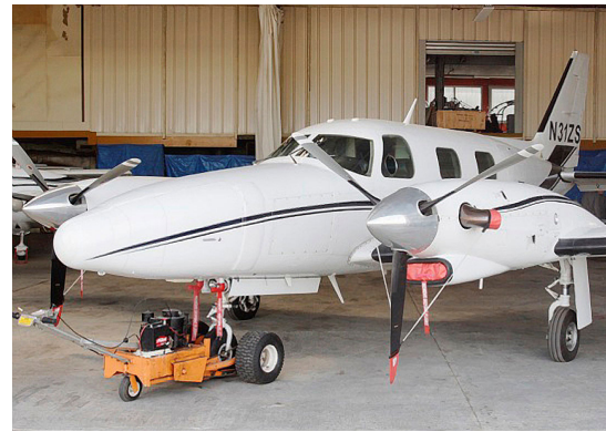
Piper Cheyenne IIXL Prop Tie/Exhaust Covers, Intake Plugs