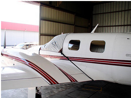
Piper Cheyenne Cockpit Cover

This cover type is made from Silver Acrylic Sunbrella canvas and is 100% lined with a soft and smooth microfiber. Bruce's Custom Covers developed this material combination especially for aircraft protection. The outer material is medium weight and treated for water resistance, UV resistance and anti-static buildup. The inner lining is a very soft and smooth microfiber to prevent scratching. The material is very reflective, and tests show that the cabin interior temperature can be reduced to near-ambient temperature on the hottest of days. It is water, ice and snow repellent, yet breathable to allow moisture to escape from between the cover and the aircraft surface.