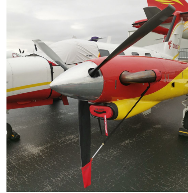
Piper PA-42 Cheyenne III Engine Plugs, Prop Ties, Cockpit Cover Piper PA-42 Cheyenne III Prop Tie/Exhaust Cover, Inlet Plugs