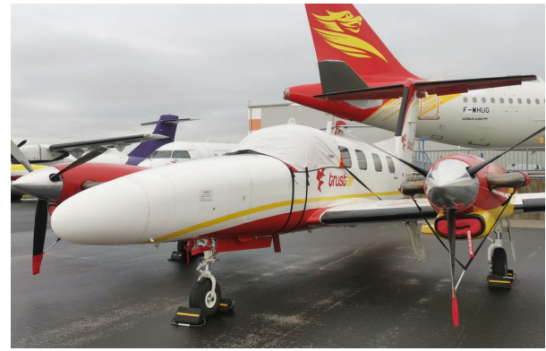
Piper Mojave Canopy Cover and Engine Inlet Plugs, Cockpit Cover (Top to Bottom)