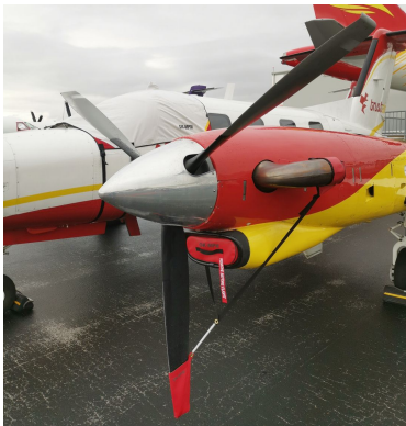
Piper PA-42 Cheyenne III Prop Tie/Exhaust Cover, Inlet Plugs

This cover type is made from Silver Acrylic Sunbrella canvas and is 100% lined with a soft and smooth microfiber. Bruce's Custom Covers developed this material combination especially for aircraft protection. The outer material is medium weight and treated for water resistance, UV resistance and anti-static buildup. The inner lining is a very soft and smooth microfiber to prevent scratching. The material is very reflective, and tests show that the cabin interior temperature can be reduced to near-ambient temperature on the hottest of days. It is water, ice and snow repellent, yet breathable to allow moisture to escape from between the cover and the aircraft surface.