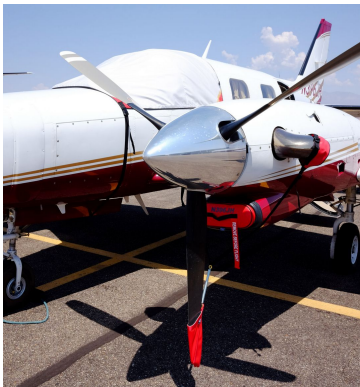
Piper Cheyenne Cockpit Cover, Engine Plugs, Prop Tie/Exhaust Covers

Travel Covers are made with Silver Solution-Dyed Polyester fabric and only lined over the windshield to save weight. The material is lightweight and more compact for easy stowage in the aircraft. The polyester material is water resistant, but only intended for occasional use outside. We also have an ultra lightweight material available for fitted hangar dust covers. For daily outdoor use, the non-travel Sunbrella Cover is the best choice.