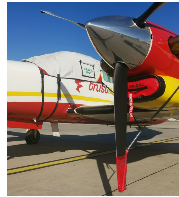
Piper PA-42 Cheyenne III Prop Tie/Exhaust Cover, Inlet Plugs Piper PA-42 Cheyenne III Engine Plugs, Prop Ties, Cockpit Cover