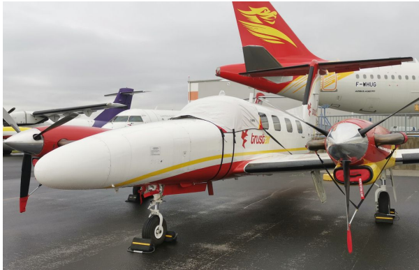
Piper PA-42 Cheyenne III Cockpit Cover, Prop Tie/Exhaust Cover, Inlet Plugs

Engine Inlet Plugs are custom fit for your Piper PA-42 Cheyenne III intakes, made with heavy-duty vinyl material, and stuffed with a single block of sculpted urethane foam. Each plug has a zipper that allows the foam to be removed and dried if necessary. Engine plugs have warning flags that are visible from the cockpit or 'remove before flight' streamers sewn onto the face of the plugs. Most plugs are imprinted with the aircraft registration number in black for an extra charge. Storage bag NOT included. Engine plugs may be inserted after flight when the engine is still warm. Engine Inlet Plugs are commonly referred to as Cowl Plugs, Intake Plugs, Cowl Blocks, Engine Blocks, and Engine Bungs.