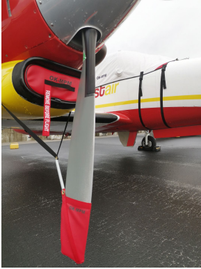
Piper PA-42 Cheyenne III Prop Tie/Exhaust Cover, Inlet Plugs

Engine Inlet Plugs are custom fit for your Piper PA-42 Cheyenne III intakes, made with heavy-duty vinyl material, and stuffed with a single block of sculpted urethane foam. Each plug has a zipper that allows the foam to be removed and dried if necessary. Engine plugs have warning flags that are visible from the cockpit or 'remove before flight' streamers sewn onto the face of the plugs. Most plugs are imprinted with the aircraft registration number in black for an extra charge. Storage bag NOT included. Engine plugs may be inserted after flight when the engine is still warm. Engine Inlet Plugs are commonly referred to as Cowl Plugs, Intake Plugs, Cowl Blocks, Engine Blocks, and Engine Bunges.