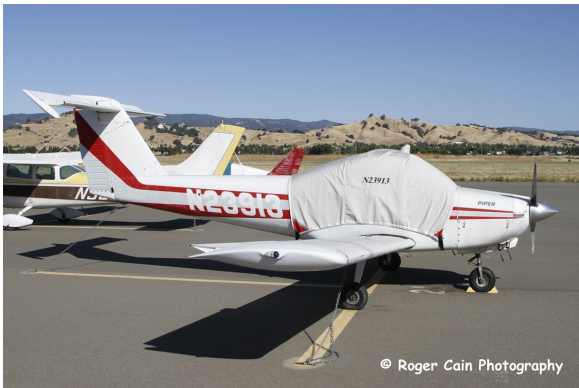
Piper Tomahawk Extended Canopy Cover

This cover type is made from Silver Acrylic Sunbrella canvas and is 100% lined with a soft and smooth microfiber. Bruce's Custom Covers developed this material combination especially for aircraft protection. The outer material is medium weight and treated for water resistance, UV resistance and anti-static buildup. The inner lining is a very soft and smooth microfiber to prevent scratching. The material is very reflective, and tests show that the cabin interior temperature can be reduced to near-ambient temperature on the hottest of days. It is water, ice and snow repellent, yet breathable to allow moisture to escape from between the cover and the aircraft surface.