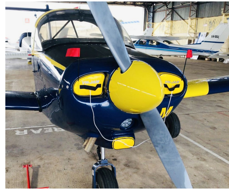
Piper PA-38 Tomahawk Engine Inlet Plugs with custom color