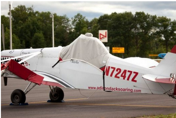
Piper Pawnee Canopy Cover