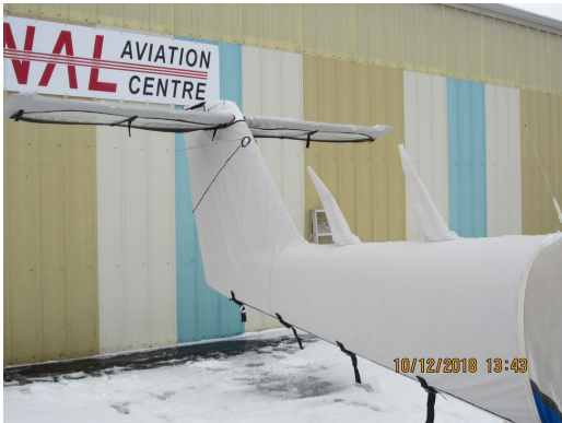
Piper PA-38 Tomahawk Empennage Cover (Tailboom, Vertical & Horiz Stabilizers) Set (W/Horiz. Stab. Cover), Winter Use

WINTER USE MATERIAL - Made with Solution-Dyed Polyester fabric, this option is intended for seasonal use to aid in deicing, rain mitigation, or for occasional travel. The material is lighter and more compact, but more susceptible to UV damage and may have a shorter useful life if used continuously outside than the all-year use material.