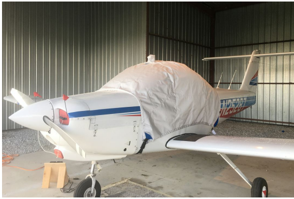
Piper PA-38 Canopy Cover