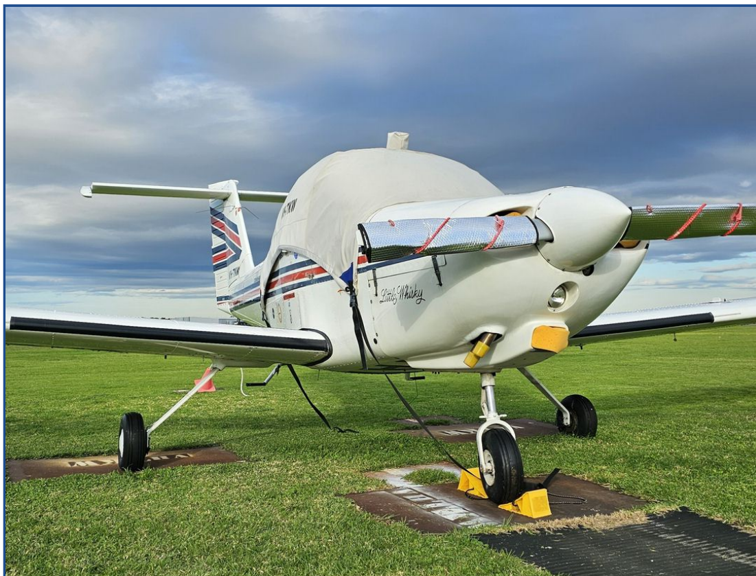
Piper PA-38 Tomahawk Canopy Cover