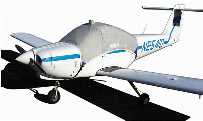
Piper Tomahawk Canopy Cover

Travel Covers are made with Silver Solution-Dyed Polyester fabric and only lined over the windshield to save weight. The material is lightweight and more compact for easy stowage in the aircraft. The polyester material is water resistant, but only intended for occasional use outside. We also have an ultra lightweight material available for fitted hangar dust covers. For daily outdoor use, the non-travel Sunbrella Cover is the best choice.