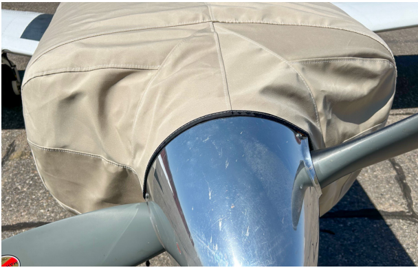
Piper PA-32 Saratoga Engine Cover