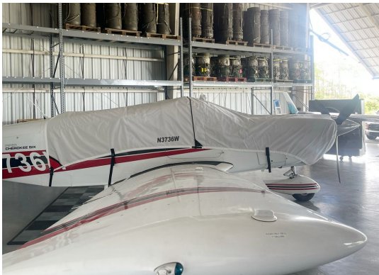
Piper Cherokee Six Canopy/Engine Cover

This cover type is made from Silver Acrylic Sunbrella canvas and is 100% lined with a soft and smooth microfiber. Bruce's Custom Covers developed this material combination especially for aircraft protection. The outer material is medium weight and treated for water resistance, UV resistance and anti-static buildup. The inner lining is a very soft and smooth microfiber to prevent scratching. The material is very reflective, and tests show that the cabin interior temperature can be reduced to near-ambient temperature on the hottest of days. It is water, ice and snow repellent, yet breathable to allow moisture to escape from between the cover and the aircraft surface.