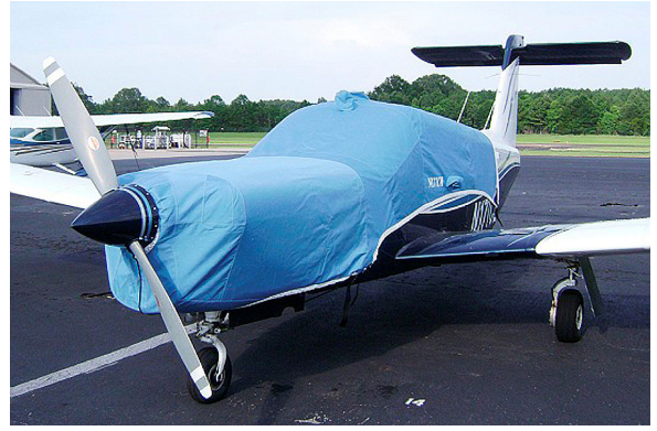
Piper PA-32 Lance Canopy/Engine Cover