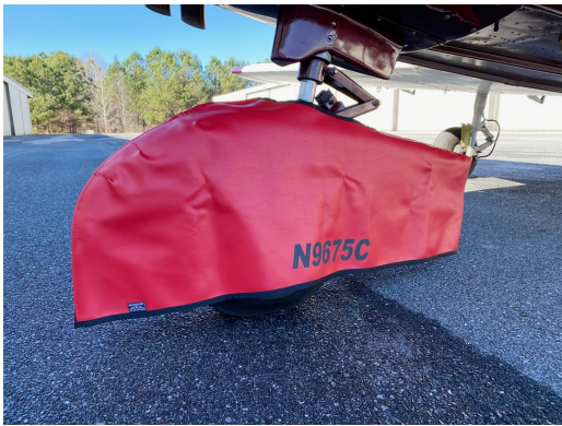
Piper PA-32 Saratoga Front Wheelpant Cover

protection and cover longevity. This heavier more durable material is intended for all weather conditions, such as rain and snow or lots of sun.