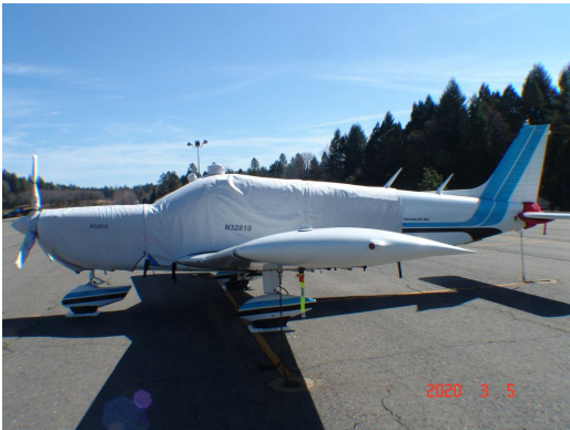
Piper PA-32 Models Tailcone Cover, Fully Enclosed