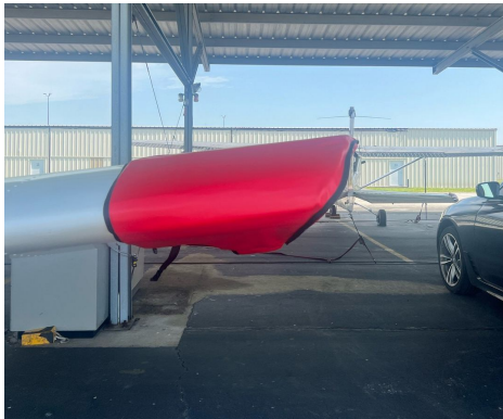
Piper PA-28-140 Wingtip Pads

Designed to prevent damage to the aircraft extremities in crowded hangars, these products are made of bright red Naugahyde and thickly padded with a sandwich of closed cell foam.