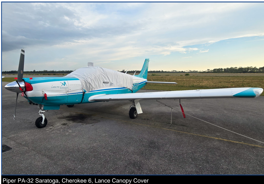
Piper PA-32 Saratoga, Cherokee 6, Lance Canopy Cover