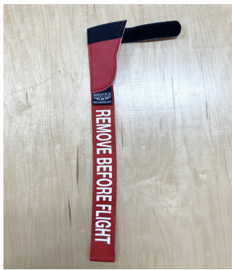
Piper Style Pitot Tube Cover, with Velcro Strap