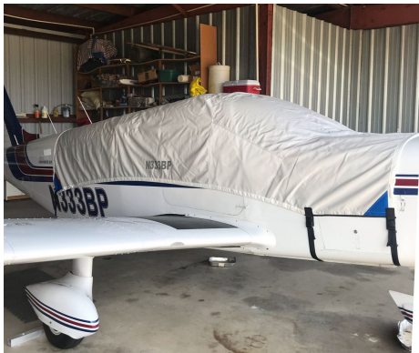
Piper PA-32-300 canopy cover with forward bib to cover baggage door