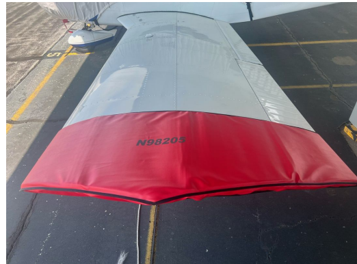
Piper PA-28-140 Wingtip Pads