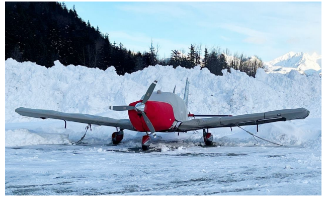
Piper PA-32-260 Winter Cover Set