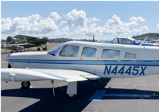
Piper PA32-300 HeatShield Set

Windshield Heatshields are interior sunshades for an aircraft's front windshield. The product is a unique composite of closed-cell foam with a silver mylar finish. The semi-rigid design is stiff enough to stand along the inside of the windshield using sun visors or window framing. It folds up flat and easily stores in the included storage sleeve. Some designs may require velcro and suction cups or split right and left sides. A Heatshield is an excellent short-term remedy for cockpit overheating. An external fabric cover is far more effective and practical for long-term protection.