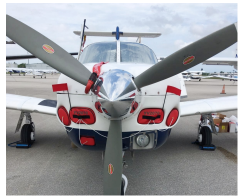
Piper PA-32 Engine Inlet Plugs