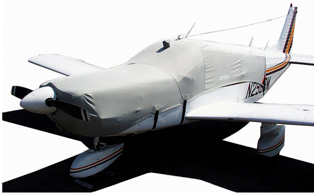
Piper Cherokee Six Canopy/Engine Cover