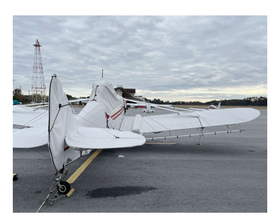
Piper PA-25 Pawnee Cover Set