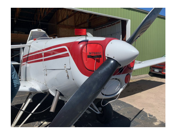
Piper PA-25 Pawnee Engine Plugs