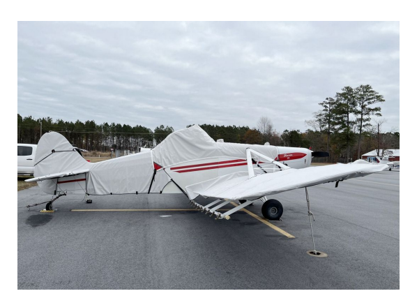
Piper PA-25 Pawnee Cover Set

WINTER USE MATERIAL - Made with Solution-Dyed Polyester fabric, this option is intended for seasonal use to aid in deicing, rain mitigation, or for occasional travel. The material is lighter and more compact, but more susceptible to UV damage and may have a shorter useful life if used continuously outside than the all-year use material.