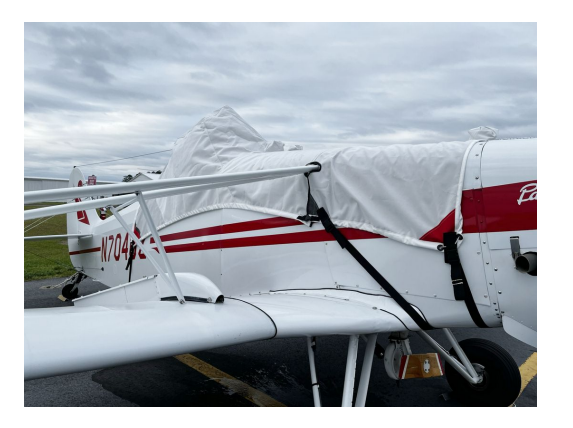
Piper Pawnee PA25 Canopy/Hopper Cover