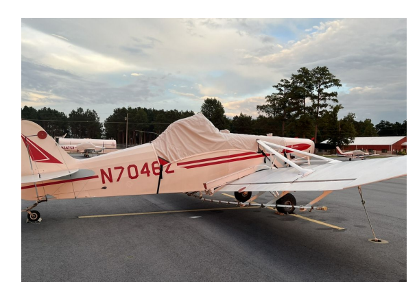
Piper PA-25 Pawnee Canopy/Hopper Cover