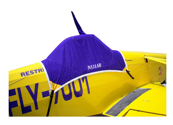
Piper Pawnee Canopy Cover

occasional use outside. We also have an ultra lightweight material available for fitted hangar dust covers. For daily outdoor use, the non-travel Sunbrella Cover is the best choice.