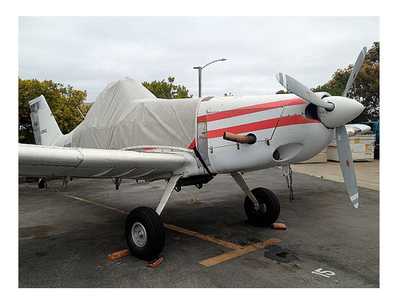
Piper Brave PA-36 Canopy/Hopper Cover