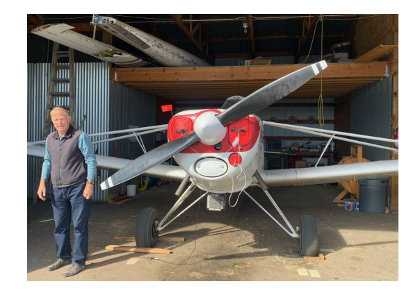
Piper PA-25 Pawnee Engine Plugs

Engine Inlet Plugs are custom fit for your Piper Pawnee PA-25 intakes, made with heavy-duty vinyl material, and stuffed with a single block of sculpted urethane foam. Each plug has a zipper that allows the foam to be removed and dried if necessary. Engine plugs have warning flags that are visible from the cockpit or 'remove before flight' streamers sewn onto the face of the plugs. Most plugs are imprinted with the aircraft registration number in black for an extra charge. Storage bag NOT included. Engine plugs may be inserted after flight when the engine is still warm. Engine Inlet Plugs are commonly referred to as Cowl Plugs, Intake Plugs, Cowl Blocks, Engine Blocks, and Engine Bungs.