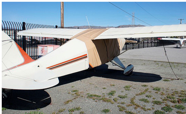
Piper PA-22-150 Pacer Extended Canopy, Engine & Prop/Spinner Covers

Travel Covers are made with Silver Solution-Dyed Polyester fabric and only lined over the windshield to save weight. The material is lightweight and more compact for easy stowage in the aircraft. The polyester material is water resistant, but only intended for occasional use outside. We also have an ultra lightweight material available for fitted hangar dust covers. For daily outdoor use, the non-travel Sunbrella Cover is the best choice.