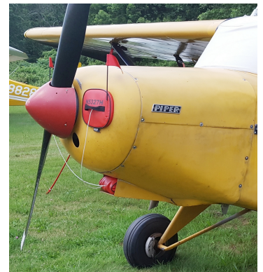
Piper PA-20 Engine Inlet Plugs