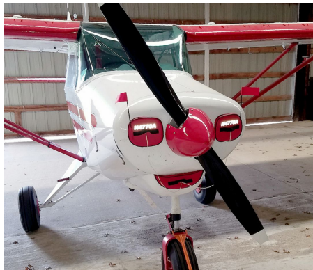
Piper Clipper, Pacer, Tri-Pacer, Vagabond, Colt: PA-15, 16, 20, 22 Engine Inlet Plugs

Engine Inlet Plugs are custom fit for your Piper Clipper, Pacer, Tri-Pacer, Vagabond, Colt: PA-15, 16, 20, 22 intakes, made with heavy-duty vinyl material, and stuffed with a single block of sculpted urethane foam. Each plug has a zipper that allows the foam to be removed and dried if necessary. Engine plugs have warning flags that are visible from the cockpit or 'remove before flight' streamers sewn onto the face of the plugs. Most plugs are imprinted with the aircraft registration number in black for an extra charge. Storage bag NOT included. Engine plugs may be inserted after flight when the engine is still warm. Engine Inlet Plugs are commonly referred to as Cowl Plugs, Intake Plugs, Cowl Blocks, Engine Blocks, and Engine Bungs.