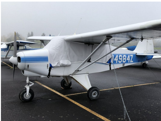
Piper PA-22 Canopy Cover

This cover type is made from Silver Acrylic Sunbrella canvas and is 100% lined with a soft and smooth microfiber. Bruce's Custom Covers developed this material combination especially for aircraft protection. The outer material is medium weight and treated for water resistance, UV resistance and anti-static buildup. The inner lining is a very soft and smooth microfiber to prevent scratching. The material is very reflective, and tests show that the cabin interior temperature can be reduced to near-ambient temperature on the hottest of days. It is water, ice and snow repellent, yet breathable to allow moisture to escape from between the cover and the aircraft surface.