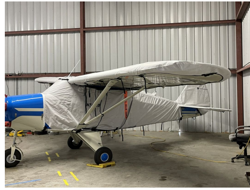
Piper PA-20-135 Wing & Empennage Covers