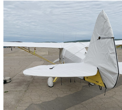
Piper PA-22 Tri-Pacer Empennage Cover