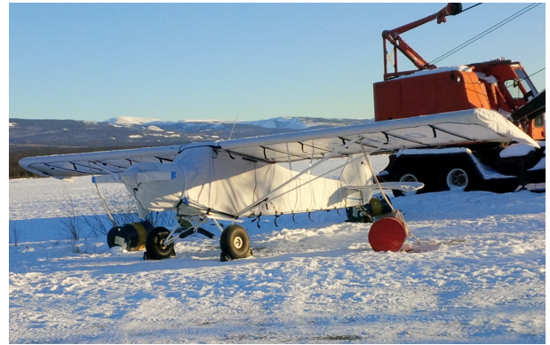
Piper Super Cub Complete Cover Set