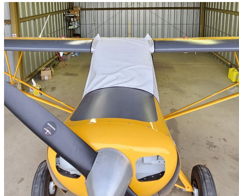
Piper PA-12: Super Cruiser, J5 Cub Windshield/Skylight Cover