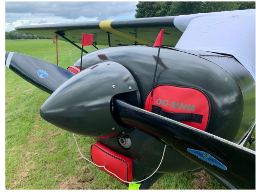
Piper PA-18 Super Cub Engine Plugs