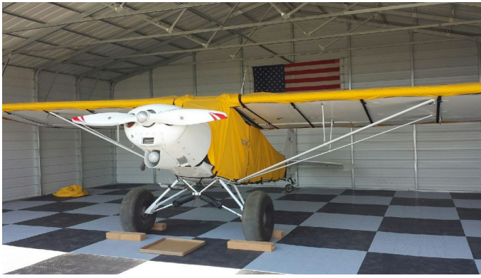
Piper PA-18 Super Cub Extended Canopy & Wing Covers