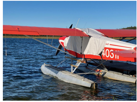
Piper PA-18 Super Cub Canopy Cover, Over Top Type