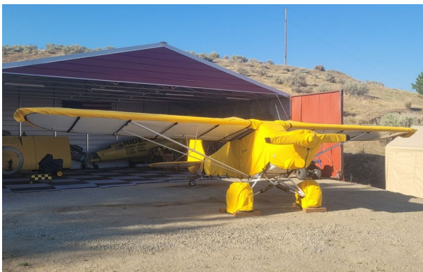
Piper PA-18 All Weather Cover Set

ALL-YEAR USE MATERIAL - Made with Silver Acrylic Sunbrella canvas, the all-year use material is the best option for sun protection and cover longevity. This heavier more durable material is intended for all weather conditions, such as rain and snow or lots of sun.