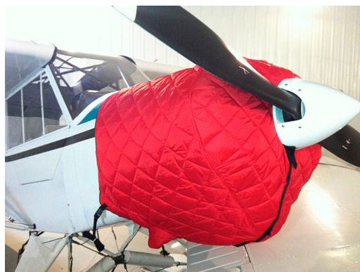
Piper Super Cub Insulated Engine Cover