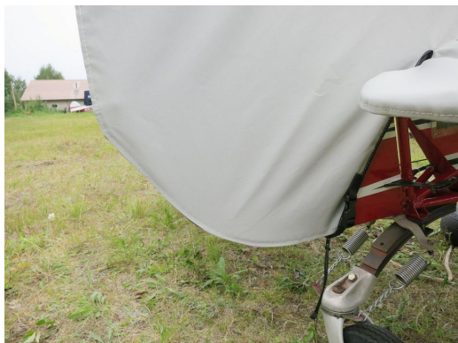
Piper PA-12 Abbreviated Empennage Cover

WINTER USE MATERIAL - Made with Solution-Dyed Polyester fabric, this option is intended for seasonal use to aid in deicing, rain mitigation, or for occasional travel. The material is lighter and more compact, but more susceptible to UV damage and may have a shorter useful life if used continuously outside than the all-year use material.