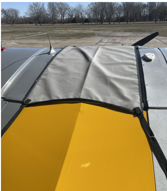
Piper PA-18 Windshield/Skylight Cover

This cover type is made from Silver Acrylic Sunbrella canvas and is 100% lined with a soft and smooth microfiber. Bruce's Custom Covers developed this material combination especially for aircraft protection. The outer material is medium weight and treated for water resistance, UV resistance and anti-static buildup. The inner lining is a very soft and smooth microfiber to prevent scratching. The material is very reflective, and tests show that the cabin interior temperature can be reduced to near-ambient temperature on the hottest of days. It is water, ice and snow repellent, yet breathable to allow moisture to escape from between the cover and the aircraft surface.