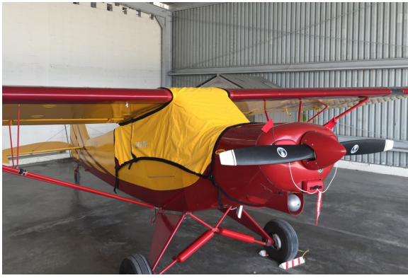
Piper Super Cub Canopy Cover, Engine Plugs