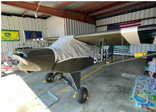
Piper PA-18 Super Cub L18-C Travel cover

This cover type is made from Silver Acrylic Sunbrella canvas and is 100% lined with a soft and smooth microfiber. Bruce's Custom Covers developed this material combination especially for aircraft protection. The outer material is medium weight and treated for water resistance, UV resistance and anti-static buildup. The inner lining is a very soft and smooth microfiber to prevent scratching. The material is very reflective, and tests show that the cabin interior temperature can be reduced to near-ambient temperature on the hottest of days. It is water, ice and snow repellent, yet breathable to allow moisture to escape from between the cover and the aircraft surface.