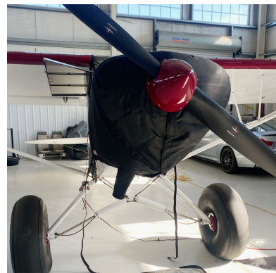
Piper PA-18 Super Cub Insulated Engine Cover