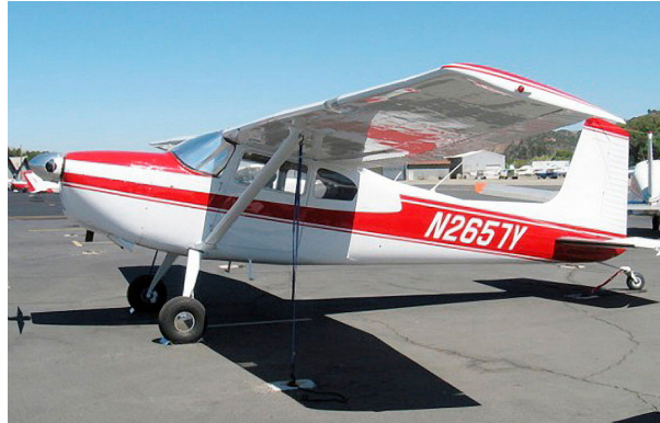
Cessna 180 & 185 Windshield HeatShield

Windshield Heatshields are interior sunshades for an aircraft's front windshield. The product is a unique composite of closed-cell foam with a silver mylar finish. The semi-rigid design is stiff enough to stand along the inside of the windshield using sun visors or window framing. It folds up flat and easily stores in the included storage sleeve. Some designs may require velcro and suction cups or split right and left sides. A Heatshield is an excellent short-term remedy for cockpit overheating. An external fabric cover is far more effective and practical for long-term protection.