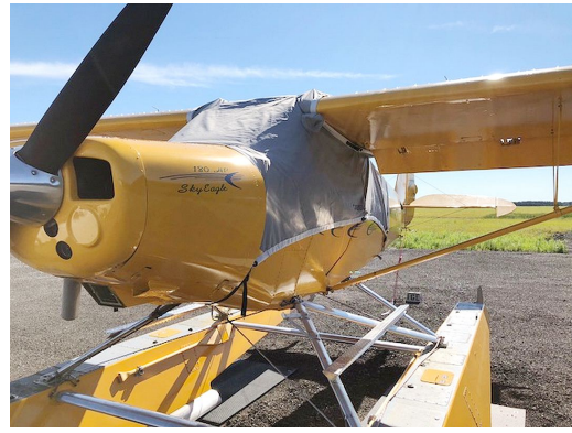
Sportsman 2+2 Wag Aero Light Weight Over the Top Travel Canopy Cover