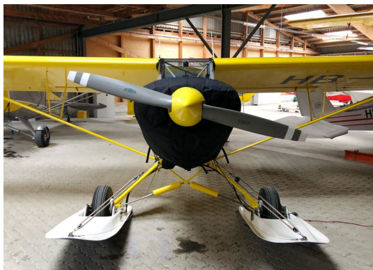
Piper PA-18 Supercub Insulated Engine Cover

This cover type is made from Silver Acrylic Sunbrella canvas and is 100% lined with a soft and smooth microfiber. Bruce's Custom Covers developed this material combination especially for aircraft protection. The outer material is medium weight and treated for water resistance, UV resistance and anti-static buildup. The inner lining is a very soft and smooth microfiber to prevent scratching. The material is very reflective, and tests show that the cabin interior temperature can be reduced to near-ambient temperature on the hottest of days. It is water, ice and snow repellent, yet breathable to allow moisture to escape from between the cover and the aircraft surface.