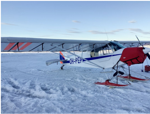
PA-18-135 Super Cub Insulated Engine Cover, Wing & Tail Covers

WINTER USE MATERIAL - Made with Solution-Dyed Polyester fabric, this option is intended for seasonal use to aid in deicing, rain mitigation, or for occasional travel. The material is lighter and more compact, but more susceptible to UV damage and may have a shorter useful life if used continuously outside than the all-year use material.