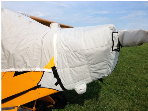
Piper J-3 Cub Insulated Engine Cover with added Pre-heater Access Flaps

This cover type is made from Silver Acrylic Sunbrella canvas and is 100% lined with a soft and smooth microfiber. Bruce's Custom Covers developed this material combination especially for aircraft protection. The outer material is medium weight and treated for water resistance, UV resistance and anti-static buildup. The inner lining is a very soft and smooth microfiber to prevent scratching. The material is very reflective, and tests show that the cabin interior temperature can be reduced to near-ambient temperature on the hottest of days. It is water, ice and snow repellent, yet breathable to allow moisture to escape from between the cover and the aircraft surface.