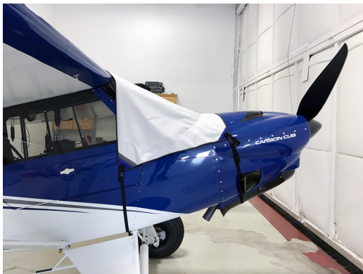
Cub Crafters CC-11 Windshield Cover