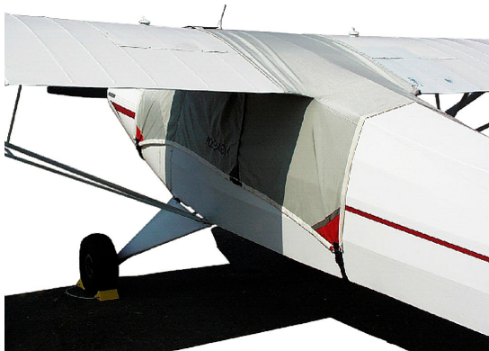
Piper PA-12 Super Cruiser Over-Top Canopy Cover

This cover type is made from Silver Acrylic Sunbrella canvas and is 100% lined with a soft and smooth microfiber. Bruce's Custom Covers developed this material combination especially for aircraft protection. The outer material is medium weight and treated for water resistance, UV resistance and anti-static buildup. The inner lining is a very soft and smooth microfiber to prevent scratching. The material is very reflective, and tests show that the cabin interior temperature can be reduced to near-ambient temperature on the hottest of days. It is water, ice and snow repellent, yet breathable to allow moisture to escape from between the cover and the aircraft surface.