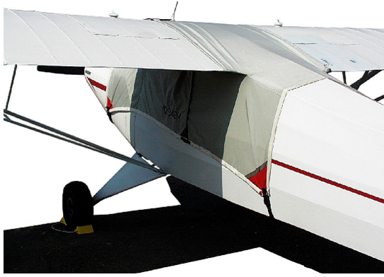
Piper PA-12 Super Cruiser Over-Top Canopy Cover

the hottest of days. It is water, ice and snow repellent, yet breathable to allow moisture to escape from between the cover and the aircraft surface.