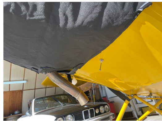
Piper PA-11 Replica Insulated Engine Cover