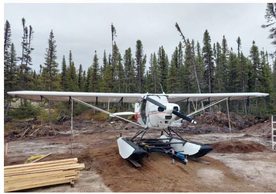
Piper PA-12 Windshield/Skylight & Wing Covers