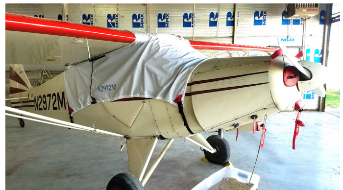
Piper PA-12 Wrap-Around Canopy Cover, Engine Plugs