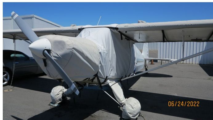
Piper PA-12 Over-Top Canopy Cover, Engine, Wing & Landing Gear Covers