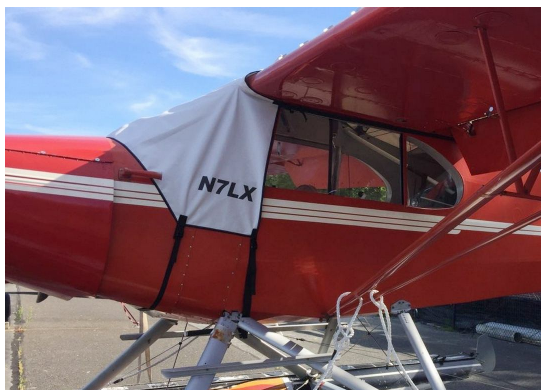
Piper PA-12 Windshield/Skylight Cover

This cover type is made from Silver Acrylic Sunbrella canvas and is 100% lined with a soft and smooth microfiber. Bruce's Custom Covers developed this material combination especially for aircraft protection. The outer material is medium weight and treated for water resistance, UV resistance and anti-static buildup. The inner lining is a very soft and smooth microfiber to prevent scratching. The material is very reflective, and tests show that the cabin interior temperature can be reduced to near-ambient temperature on the hottest of days. It is water, ice and snow repellent, yet breathable to allow moisture to escape from between the cover and the aircraft surface.