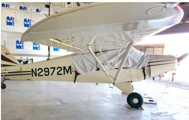
Piper PA-12 Wrap-Around Canopy Cover

This cover type is made from Silver Acrylic Sunbrella canvas and is 100% lined with a soft and smooth microfiber. Bruce's Custom Covers developed this material combination especially for aircraft protection. The outer material is medium weight and treated for water resistance, UV resistance and anti-static buildup. The inner lining is a very soft and smooth microfiber to prevent scratching. The material is very reflective, and tests show that the cabin interior temperature can be reduced to near-ambient temperature on the hottest of days. It is water, ice and snow repellent, yet breathable to allow moisture to escape from between the cover and the aircraft surface.