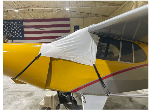
Piper J5A Windshield/Skylight Cover, test fit