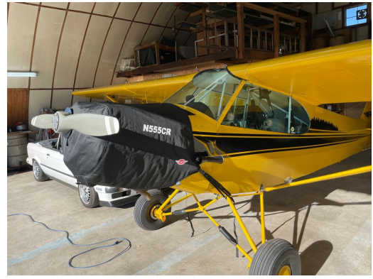
Piper PA-11 Replica Insulated Engine Cover