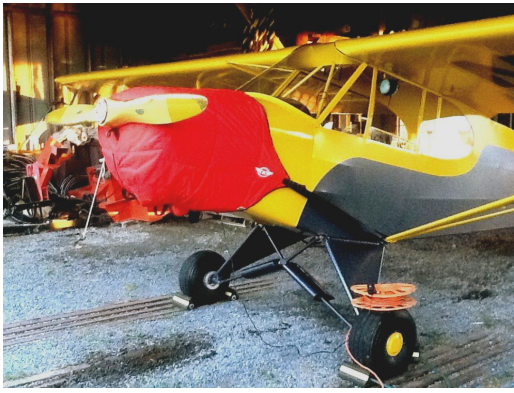
Piper PA-11 Cub Special Insulated Engine Cover