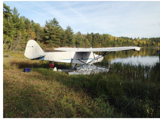
Piper PA-11 Cover Set