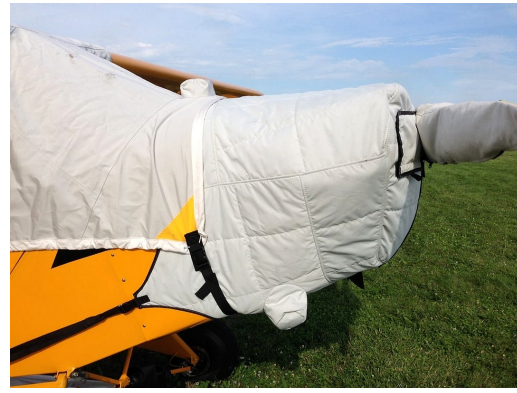
Piper J-3 Cub Insulated Engine Cover with added Pre-heater Access Flaps