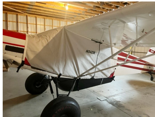
Piper PA-11 Extended Canopy Cover, Over the Top Style