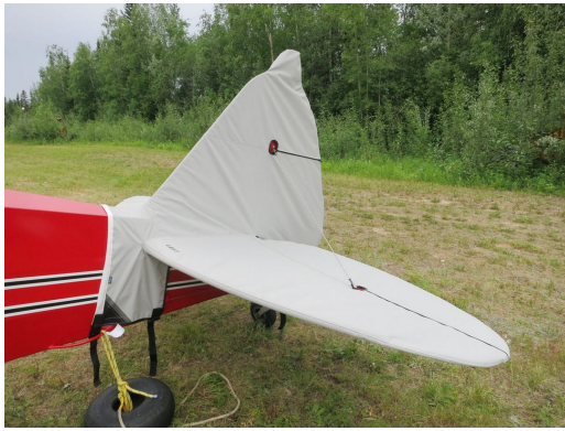
Piper PA-12 Abbreviated Empennage Cover