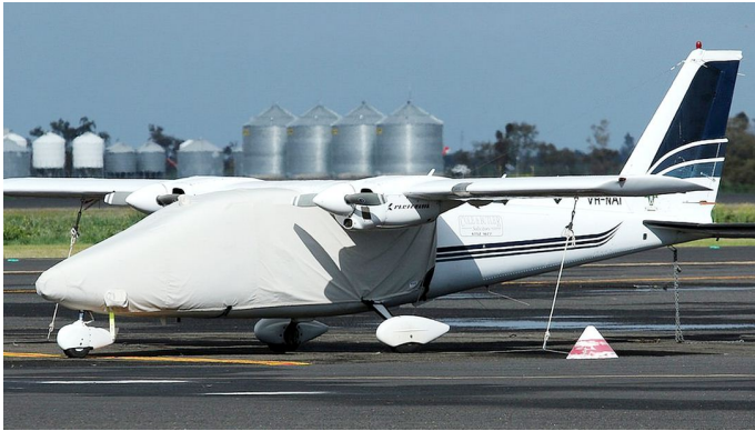
Partenavia P-68C Canopy Cover