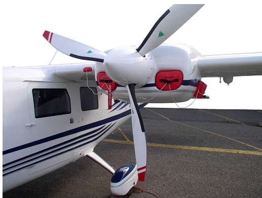
Observer Engine Plugs

Engine Inlet Plugs are custom fit for your Partenavia, Vulcanair P-68B intakes, made with heavy-duty vinyl material, and stuffed with a single block of sculpted urethane foam. Each plug has a zipper that allows the foam to be removed and dried if necessary. Engine plugs have warning flags that are visible from the cockpit or 'remove before flight' streamers sewn onto the face of the plugs. Most plugs are imprinted with the aircraft registration number in black for an extra charge. Storage bag NOT included. Engine plugs may be inserted after flight when the engine is still warm. Engine Inlet Plugs are commonly referred to as Cowl Plugs, Intake Plugs, Cowl Blocks, Engine Blocks, and Engine Bunges.