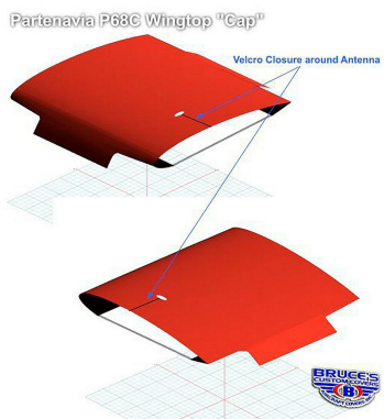
Partenavia Wing "Cap"