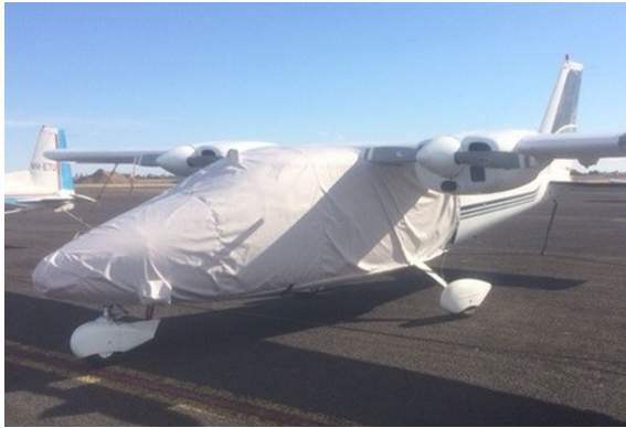
Partenavia, Vulcanair P-68C & P-68R Canopy/Nose Cover, Wrap-Around

The material is very reflective, and tests show that the cabin interior temperature can be reduced to near-ambient temperature on the hottest of days. It is water, ice and snow repellent, yet breathable to allow moisture to escape from between the cover and the aircraft surface.