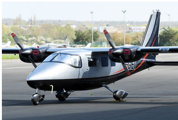
Partenavia P68c Cockpit HeatShields, Engine Plugs

Heatshields are interior sunshades for an aircraft's windows or canopy glass. The product is a unique composite of closed-cell foam with a silver mylar finish. The semi-rigid design is stiff enough to stand along the inside of the windshield using sun visors or window framing. It folds up flat and easily stores in the included storage sleeve. Some designs may require velcro and suction cups. A Heatshield is an excellent short-term remedy for cockpit overheating.